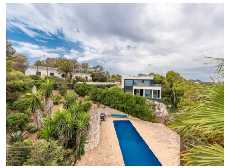
View of the pool area