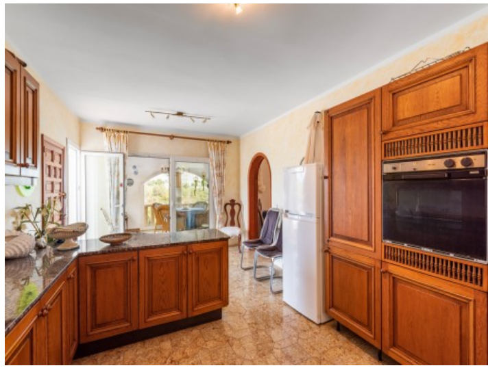
Rustic, wooden kitchen

All information is correct to the best of our knowledge. Errors and prior sale excepted. This prospectus is purely for information purposes. Only the notarized deed of sale is legally binding.