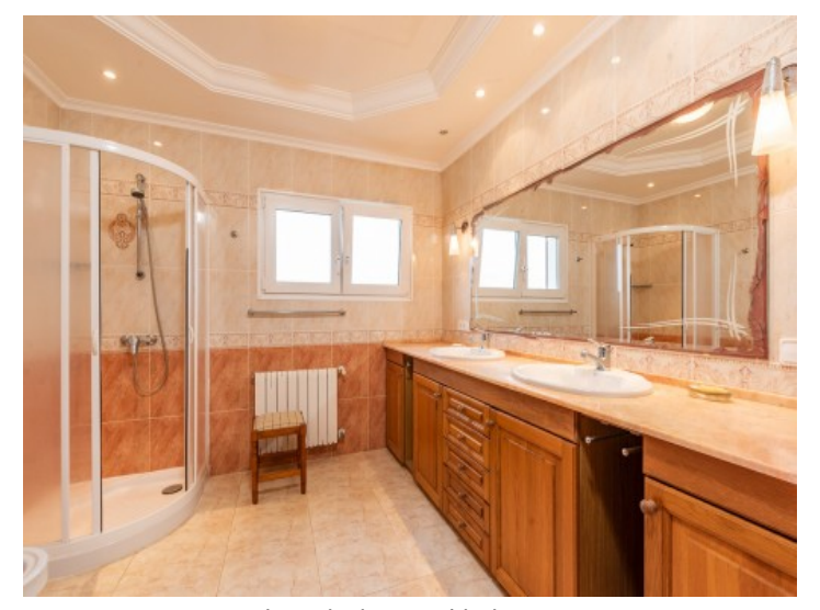
Large bathroom with shower