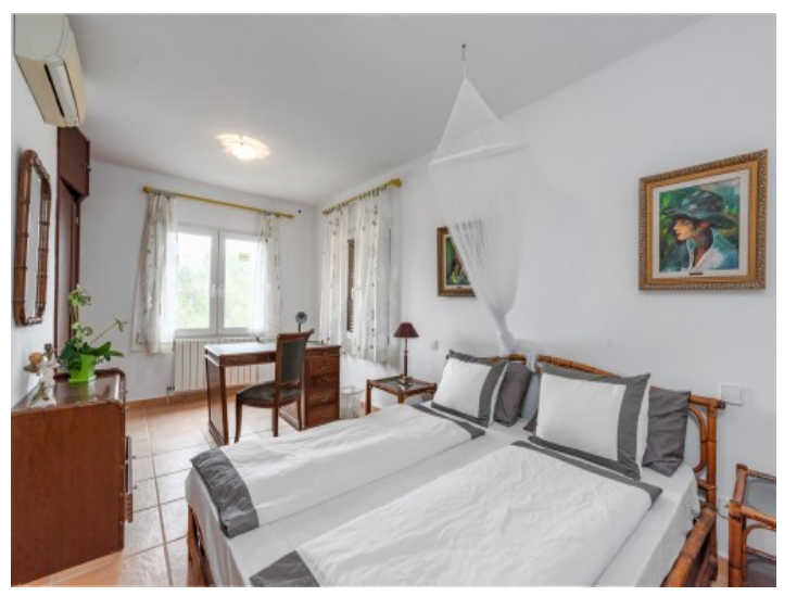
Second double bedroom