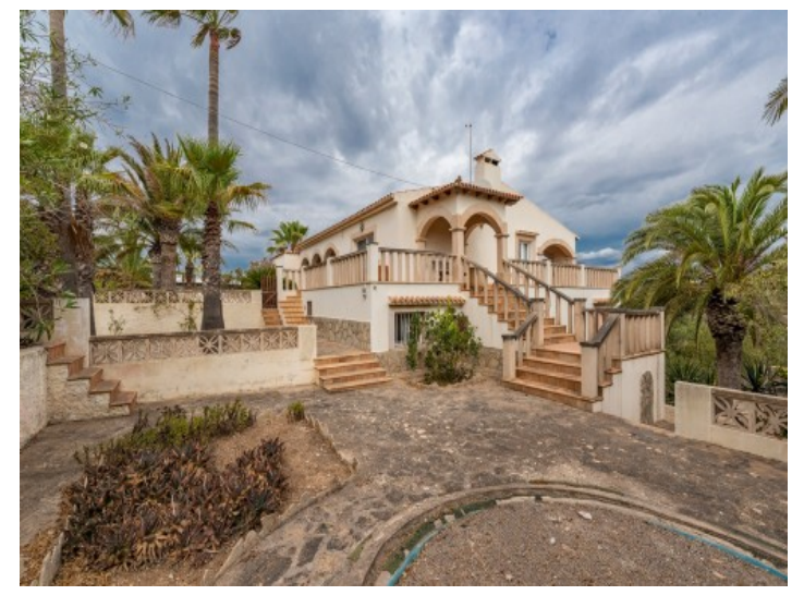
Exterior view of the sea view villa

All information is correct to the best of our knowledge. Errors and prior sale excepted. This prospectus is purely for information purposes. Only the notarized deed of sale is legally binding.