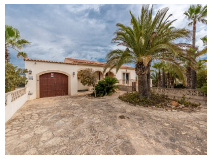
Garage and entrance area