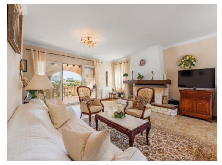
Cozy living area