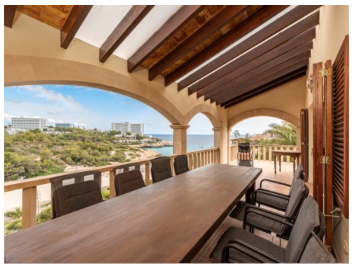
Dining area on the bacloyn