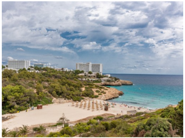
View to the Cala Murada