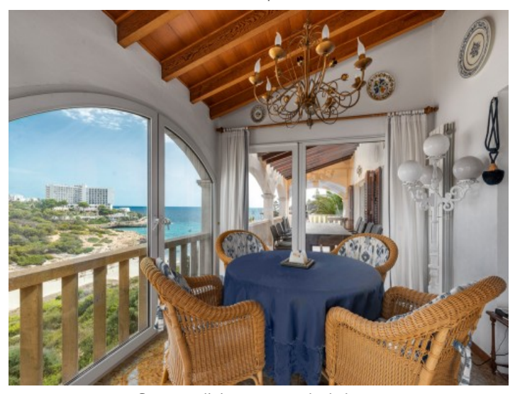
Separate dining areas on the balcony