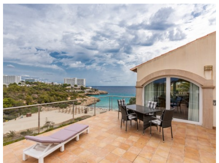
Terrace with a view