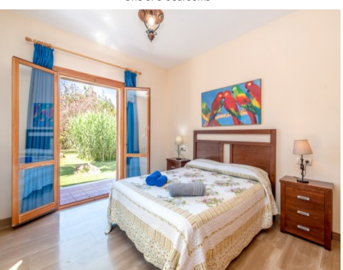
Double bedroom with garden access