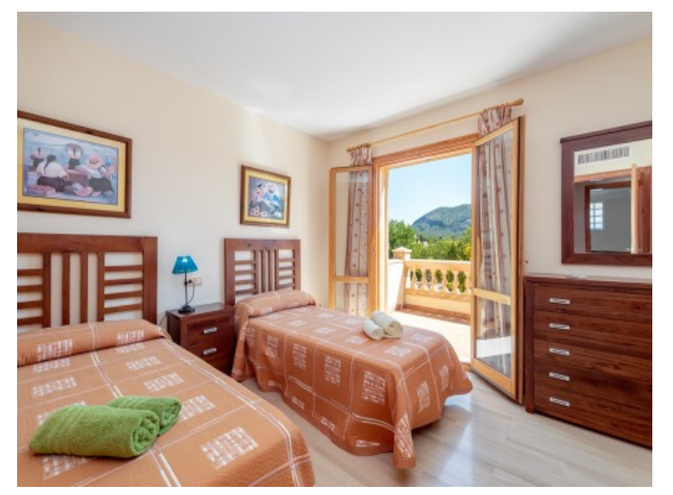
Bedroom with access to the upper terrace Upper terrace with a view All information is correct to the best of our knowledge. Errors and prior sale excepted. This prospectus is purely for information purposes. Only the notarized deed of sale is legally binding.

PORTA MALLORQUINA • C./ CONQUISTADOR 8, 07001 PALMA TEL. +34 971 698 242 • INFO@PORTAMALLORQUINA.COM