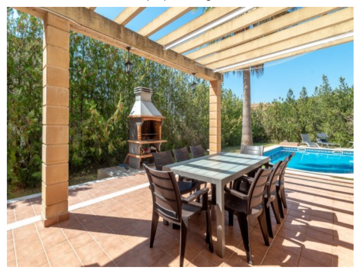
Beautiful terrace with bbq