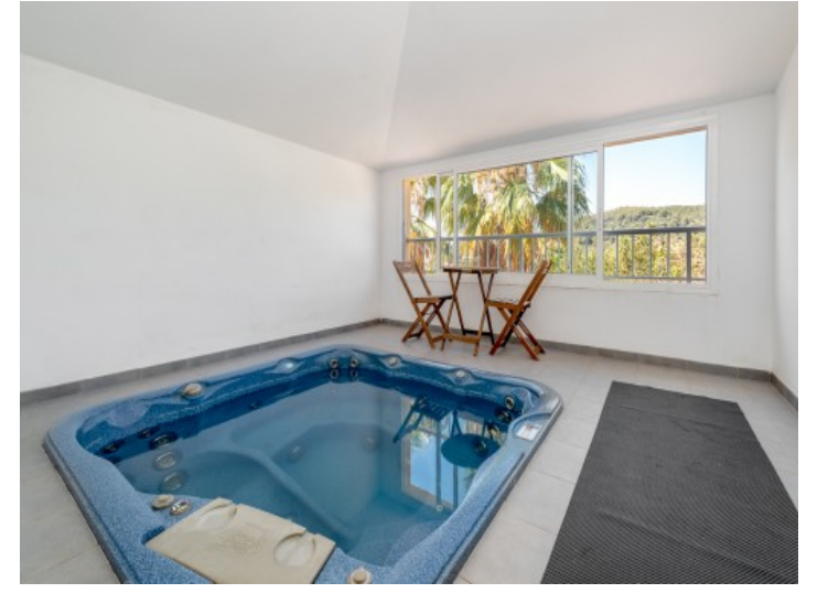
Additional room with jacuzzi