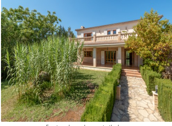
Front garden and access to the house