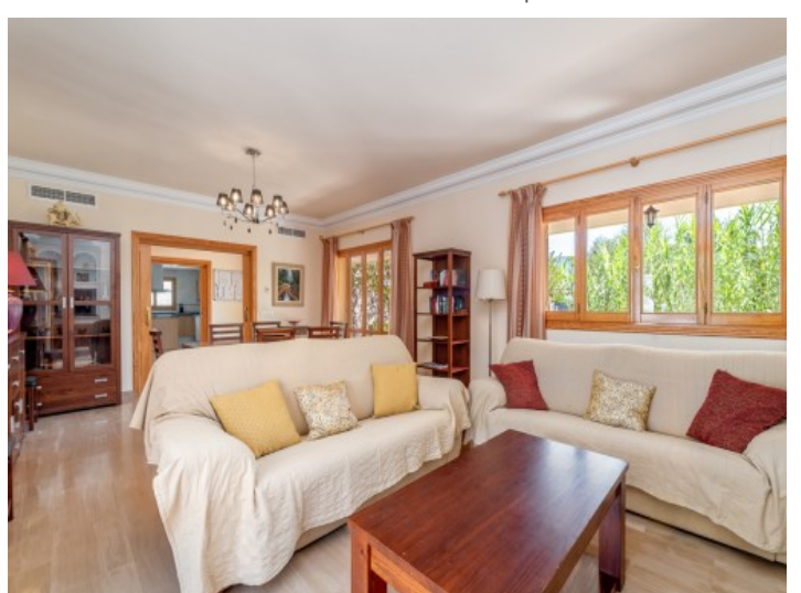
Spacious living and dining area All information is correct to the best of our knowledge. Errors and prior sale excepted. This prospectus is purely for information purposes. Only the notarized deed of sale is legally binding.

PORTA MALLORQUINA • C./ CONQUISTADOR 8, 07001 PALMA TEL. +34 971 698 242 • INFO@PORTAMALLORQUINA.COM