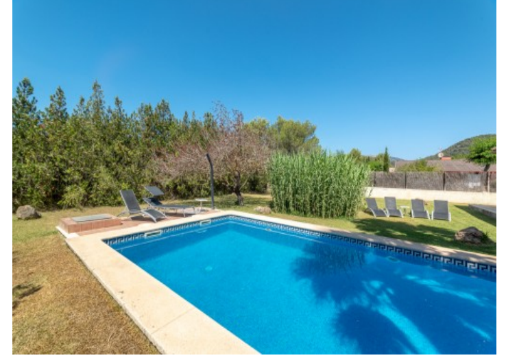
Tranquil pool and garden

PORTA MALLORQUINA® Your home. Our passion.