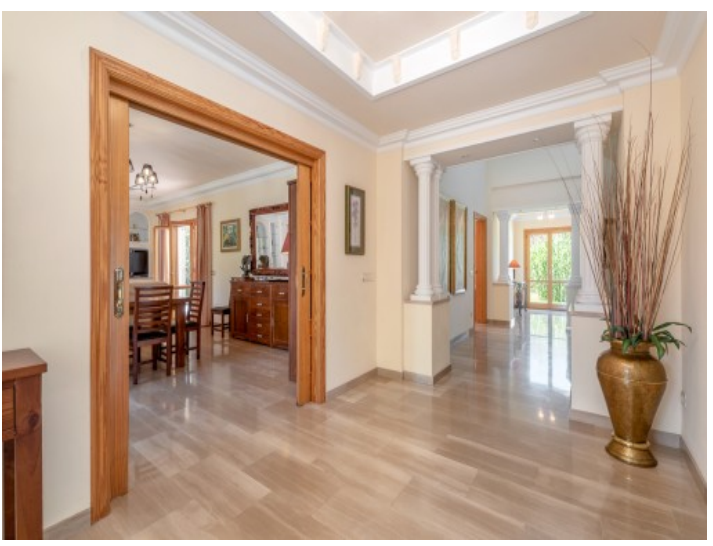
Inviting hall and corridor