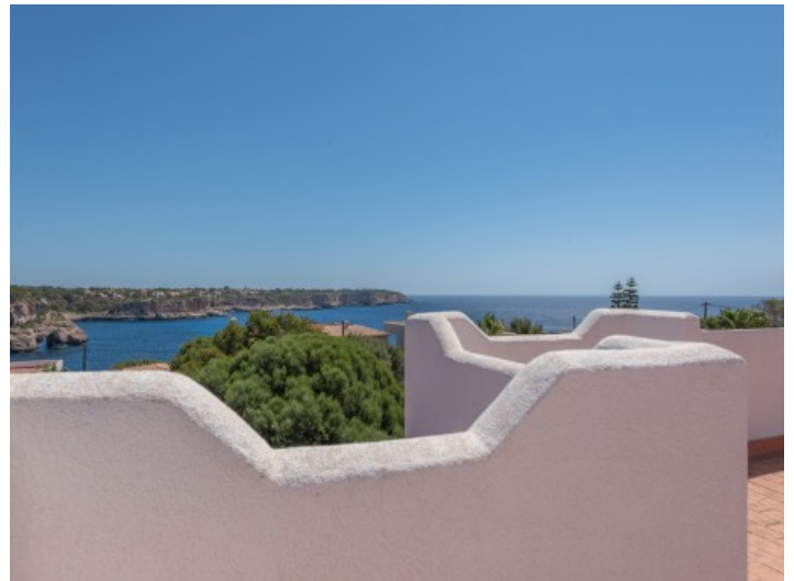
Beautiful sea views

All information is correct to the best of our knowledge. Errors and prior sale excepted. This prospectus is purely for information purposes. Only the notarized deed of sale is legally binding.