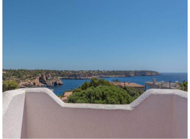
Wonderful sea views from the roof