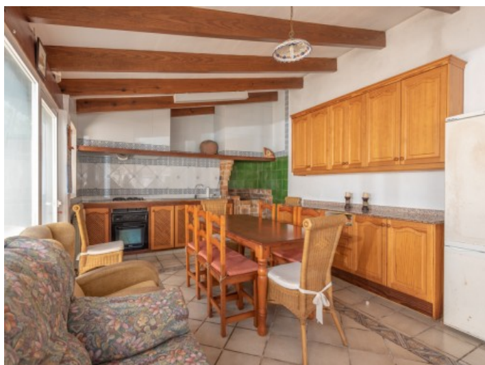
Summer house with kitchen next to the pool