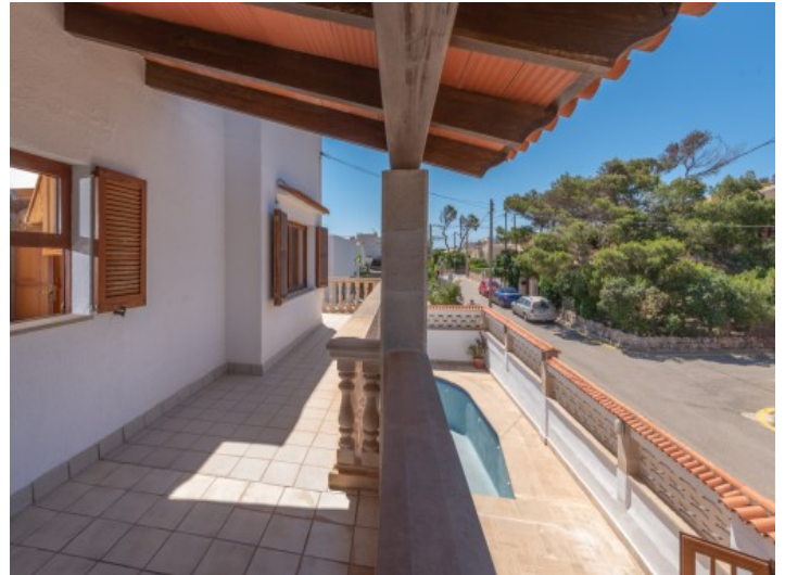
Covered balcony on the upper floor