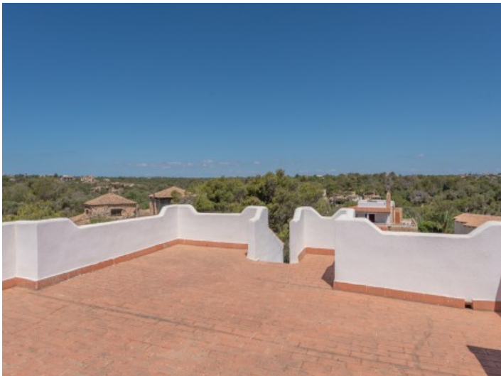
Large roof terrace with sweeping views