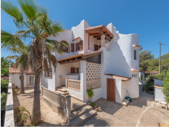
Exterior view of the large chalet