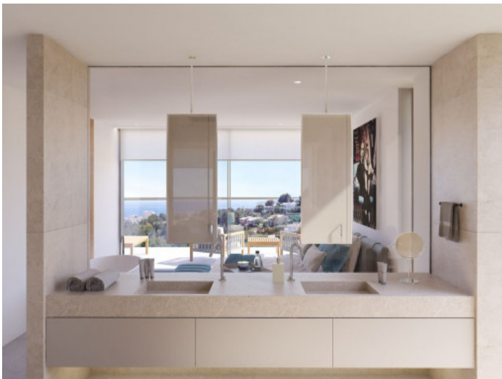
Open kitchen with panoramic views