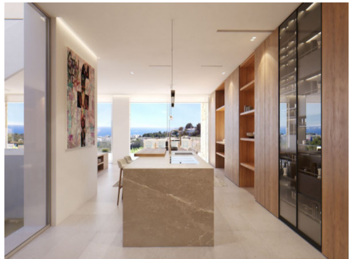
Elegant, high quality kitchen