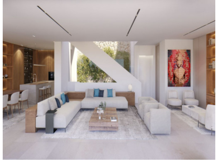
Open-plan living area