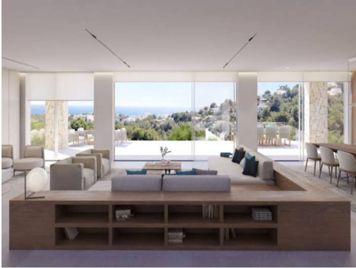
Living area with panoramic sea views