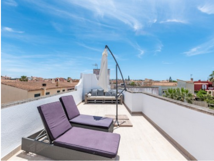
View of the terrace