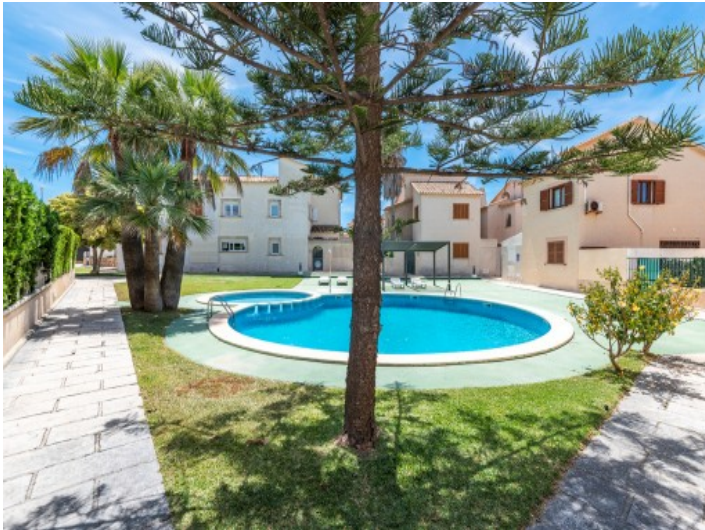
Inviting community pool