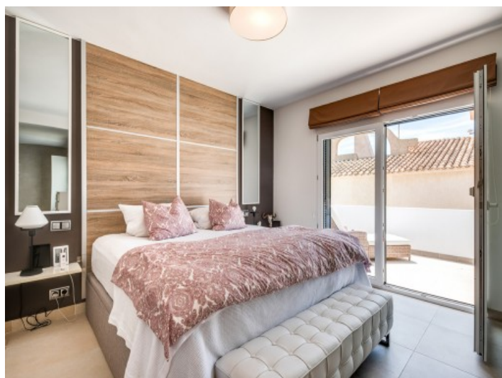
Bedroom with balcony