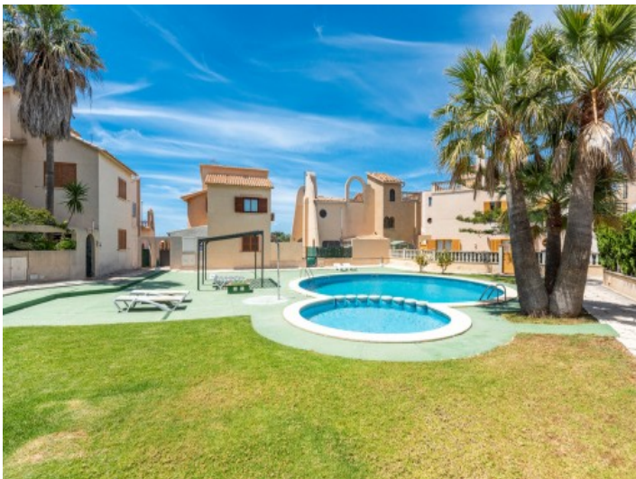
Green garden and pool area