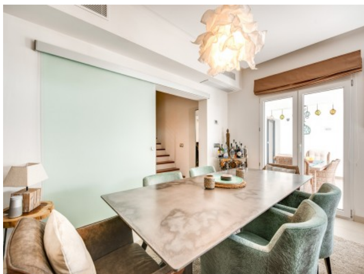
View of the dining area