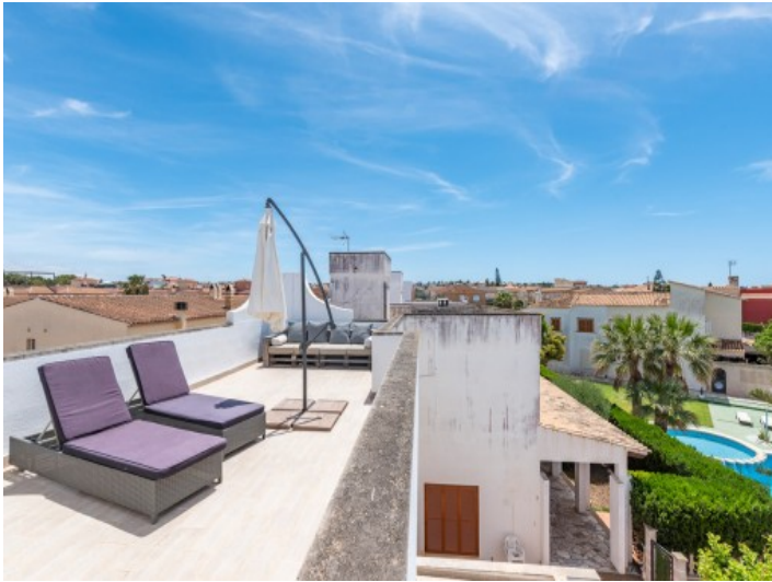
Fantastic roof top terrace