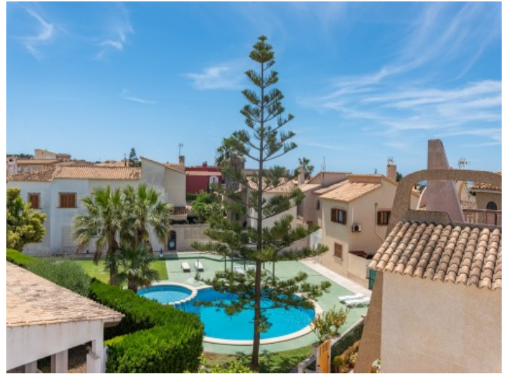
View to the community pool