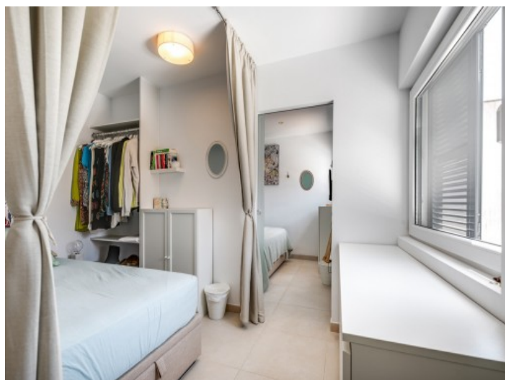
Spacious double bedroom