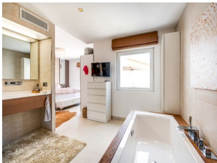
Fantastic bathroom en suite

All information is correct to the best of our knowledge. Errors and prior sale excepted. This prospectus is purely for information purposes. Only the notarized deed of sale is legally binding.