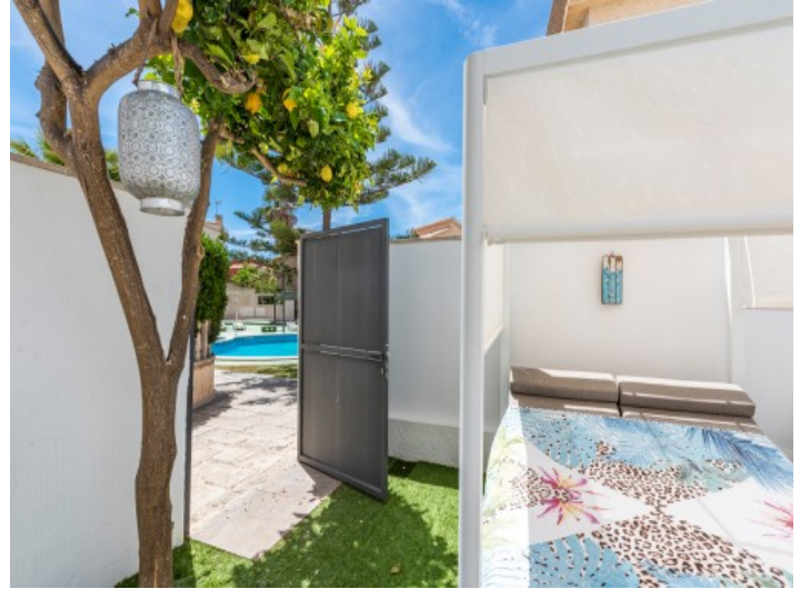
Access to the community pool