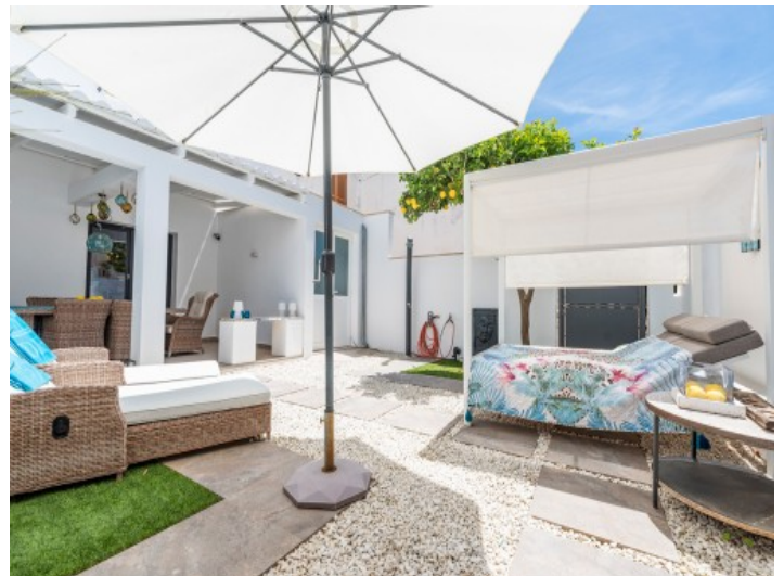
View of the terrace