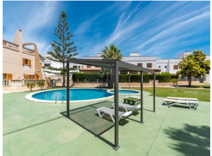
Sun loungers by the pool