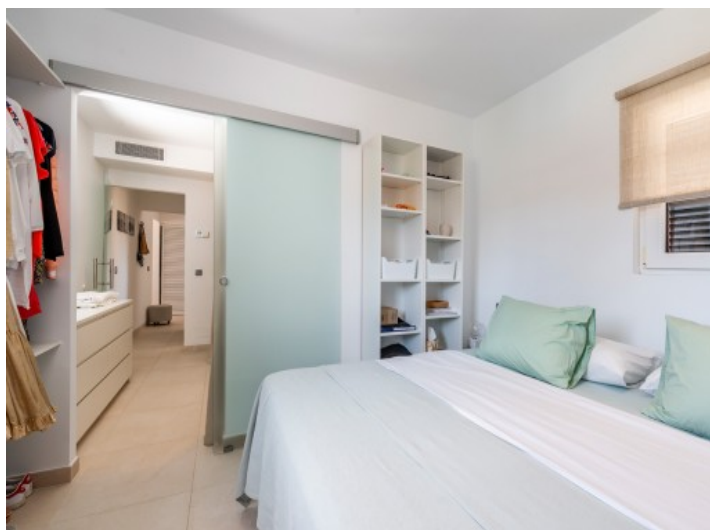
Alternative view of the bedrooms