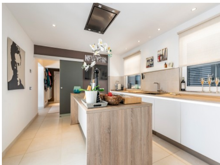
Alternative view of the kitchen