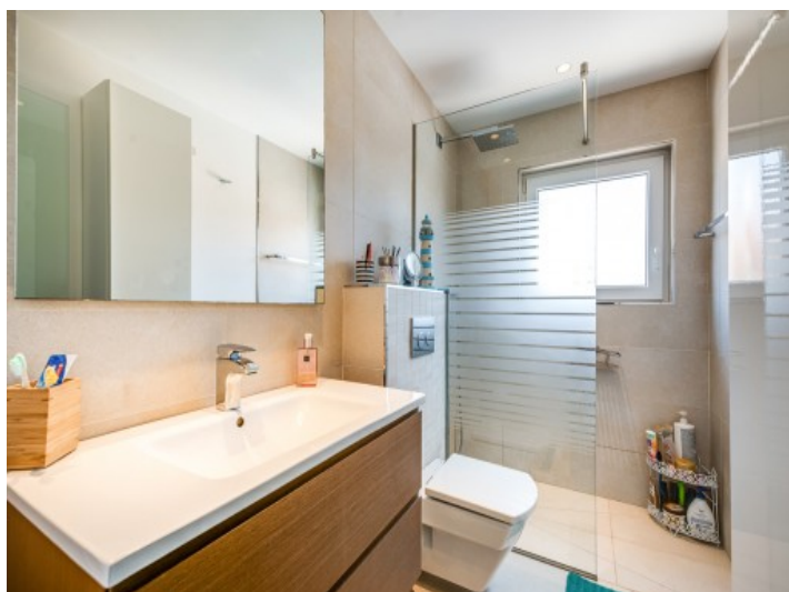
Light flooded bathroom with shower