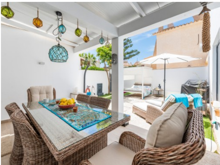
Covered dining area