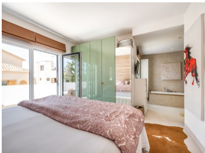
View to the bathroom en suite