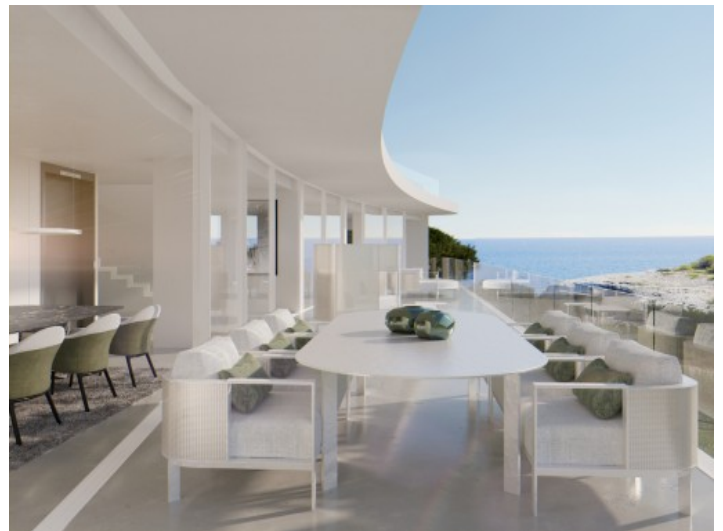
Dining area on the terrace