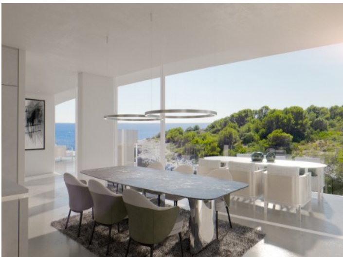
View to the terrace