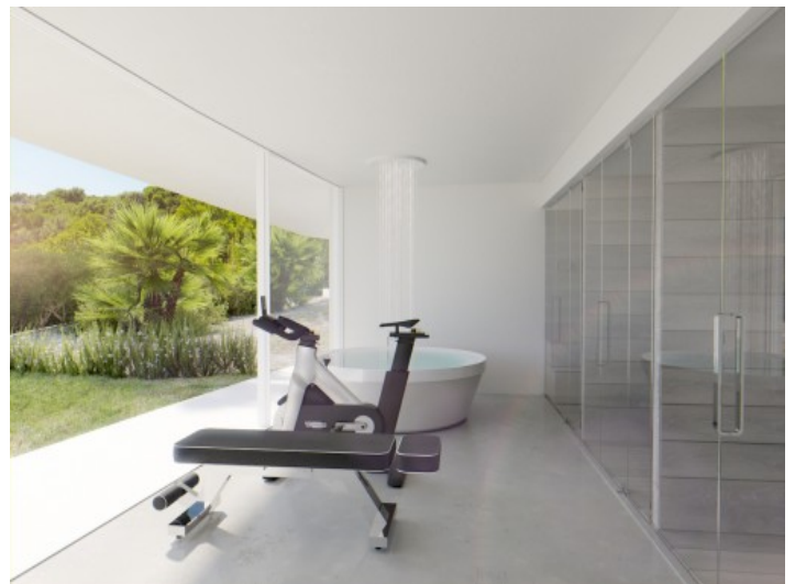
Fitness and Spa area

All information is correct to the best of our knowledge. Errors and prior sale excepted. This prospectus is purely for information purposes. Only the notarized deed of sale is legally binding.