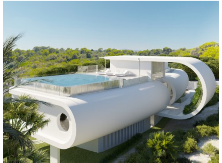
Splendid roof top pool