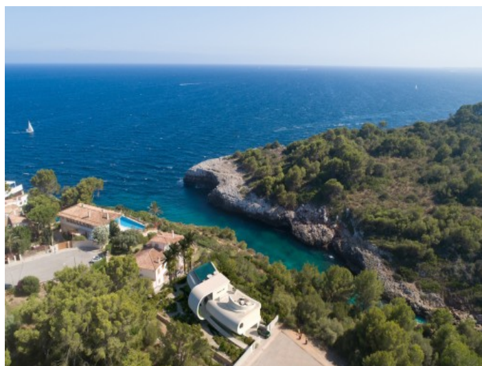
View to the sea

All information is correct to the best of our knowledge. Errors and prior sale excepted. This prospectus is purely for information purposes. Only the notarized deed of sale is legally binding.