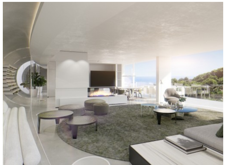
Open living area

All information is correct to the best of our knowledge. Errors and prior sale excepted. This prospectus is purely for information purposes. Only the notarized deed of sale is legally binding.