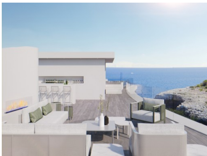
Sunny roof top terrace