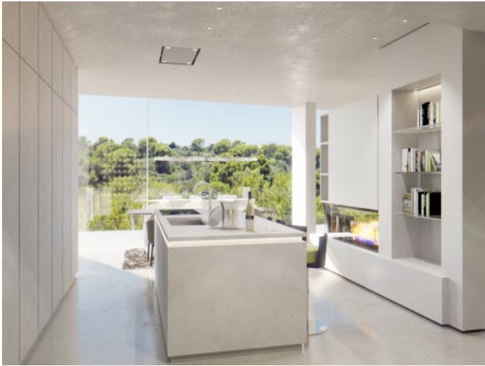
Modern kitchen with cooking island