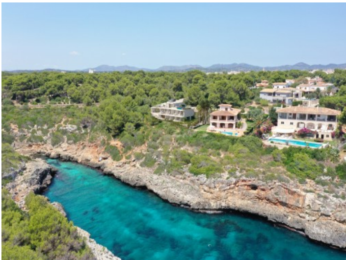
Exterior view from the sea