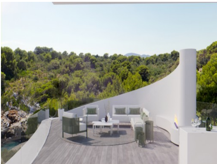
Separate chill out area