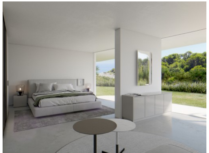
Large panoramic windows of the bedroom