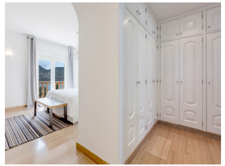
Fantastic dressing area