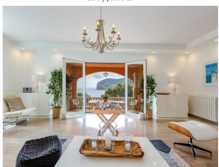
Open living area with balcony