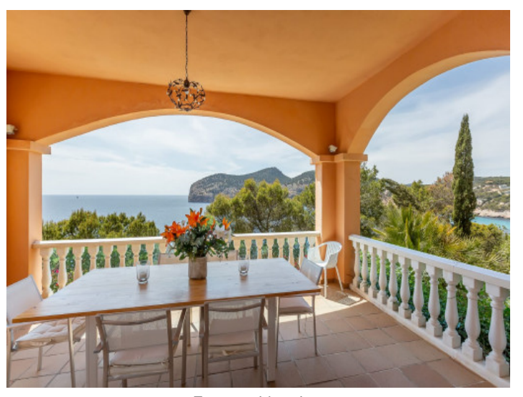
Terrace with a view

All information is correct to the best of our knowledge. Errors and prior sale excepted. This prospectus is purely for information purposes. Only the notarized deed of sale is legally binding.