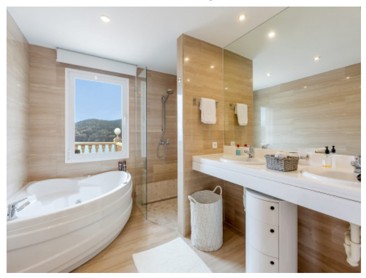
Noble bathroom with bath tub