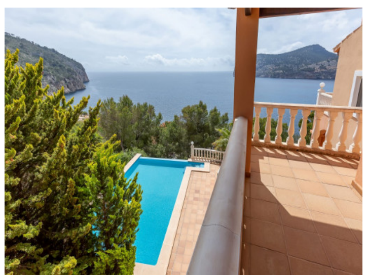
Terrace with sea views