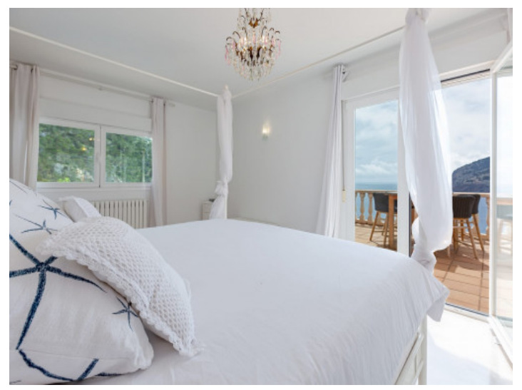
Noble bedroom with balcony