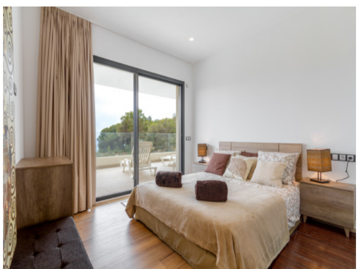
One of 4 bedrooms One of 4 bedrooms All information is correct to the best of our knowledge. Errors and prior sale excepted. This prospectus is purely for information purposes. Only the notarized deed of sale is legally binding.

PORTA MALLORQUINA • C./ CONQUISTADOR 8, 07001 PALMA TEL. +34 971 698 242 • INFO@PORTAMALLORQUINA.COM