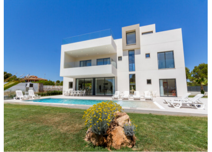
Pool and garden area Well tended pool area All information is correct to the best of our knowledge. Errors and prior sale excepted. This prospectus is purely for information purposes. Only the notarized deed of sale is legally binding.

PORTA MALLORQUINA • C./ CONQUISTADOR 8, 07001 PALMA TEL. +34 971 698 242 • INFO@PORTAMALLORQUINA.COM