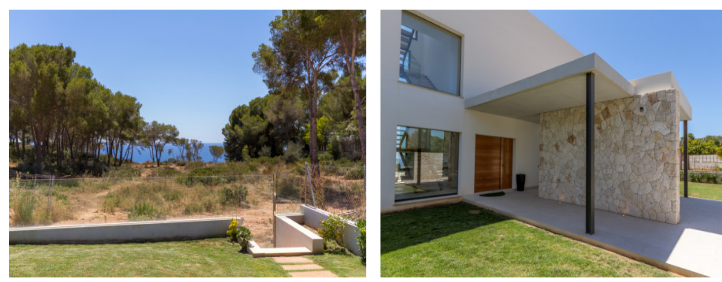
Dircet access to the sea