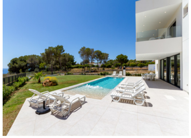
Gorgeous pool and garden area

PORTA MALLORQUINA® Your home. Our passion.