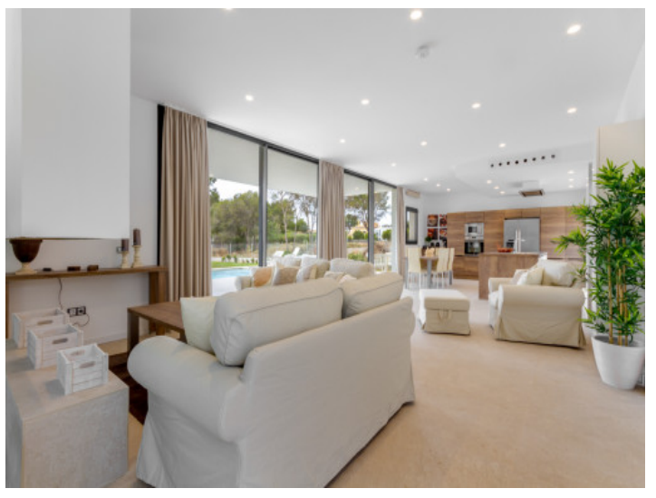
Living area with panoramic windows