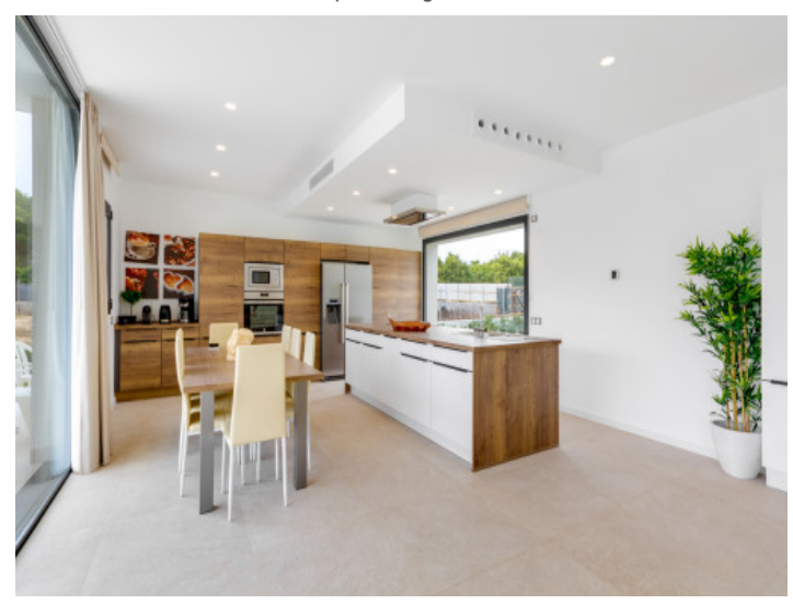
Modern kitchen and dining area