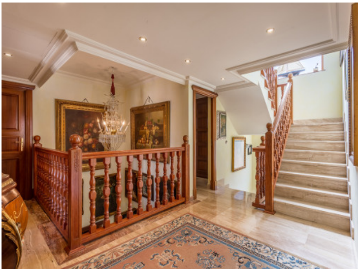
The impressive house has a living surface of 668 sqm