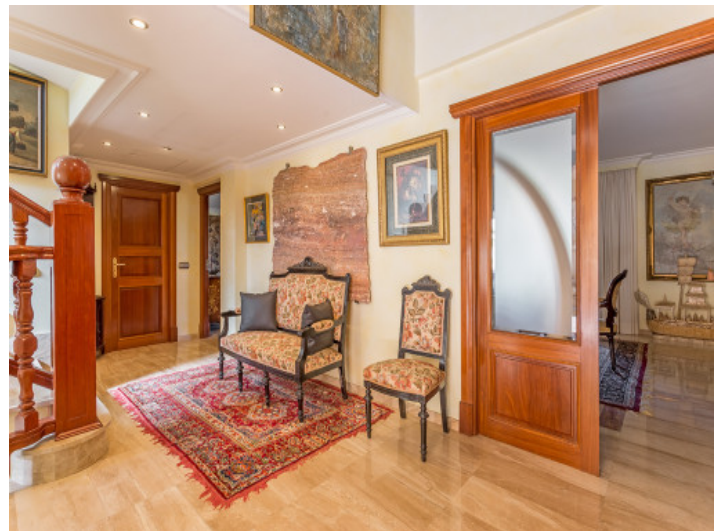
The generous house was built in 2004