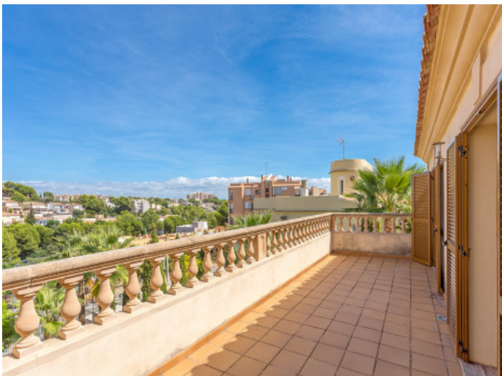
Balcony of 30 sqm with lovely views