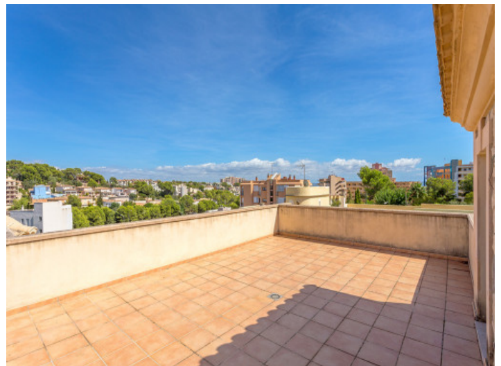
The large roof terrace offers views to the surroundings

All information is correct to the best of our knowledge. Errors and prior sale excepted. This prospectus is purely for information purposes. Only the notarized deed of sale is legally binding.