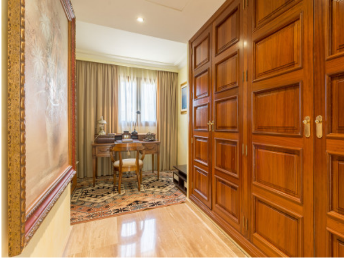
Further office corner with roomy fitted wardrobes