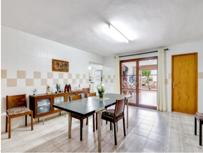
Another dining area