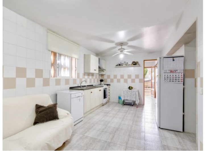
Second, fully equipped kitchen