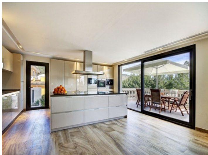
One out of 2 kitchens with access to the balcony