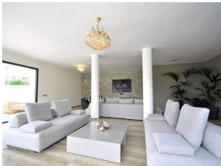
Luxury living area