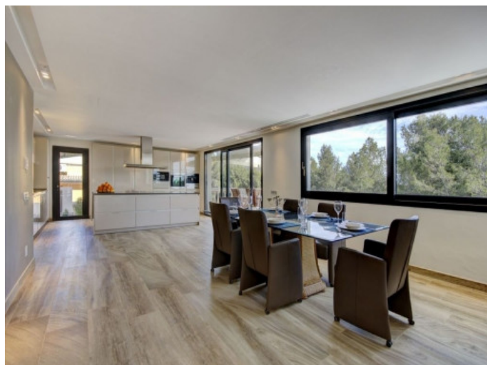
Second open dining area and kitchen

All information is correct to the best of our knowledge. Errors and prior sale excepted. This prospectus is purely for information purposes. Only the notarized deed of sale is legally binding.