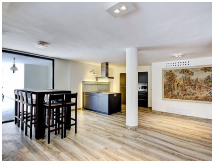
Open dining area and kitchen