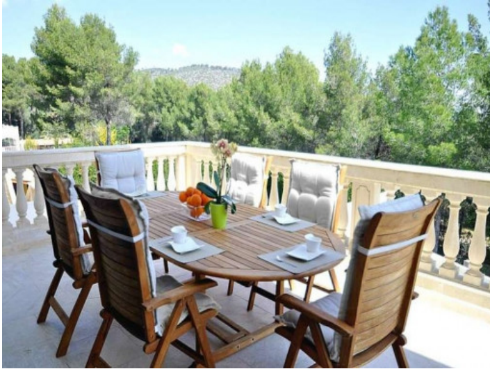
Lovely dining area on the balcony