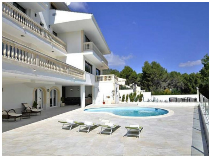
Much space to relax