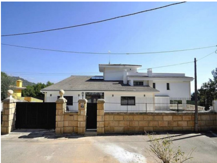
Front view of the property

All information is correct to the best of our knowledge. Errors and prior sale excepted. This prospectus is purely for information purposes. Only the notarized deed of sale is legally binding.