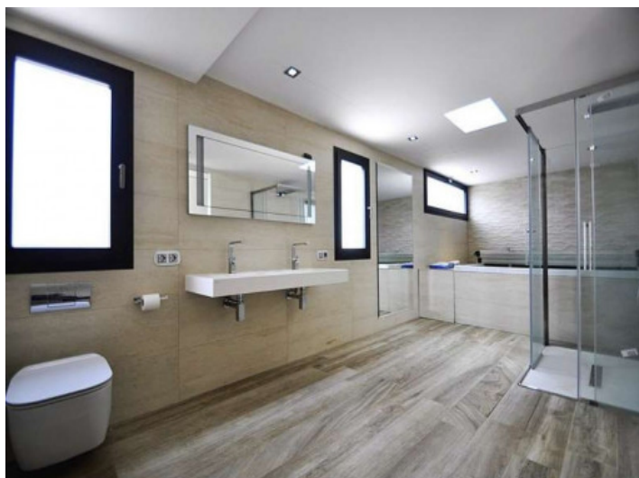
Capacious bathroom with comfortable bathtub and shower