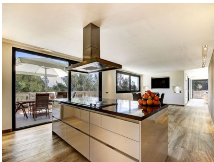
Modern cooking island