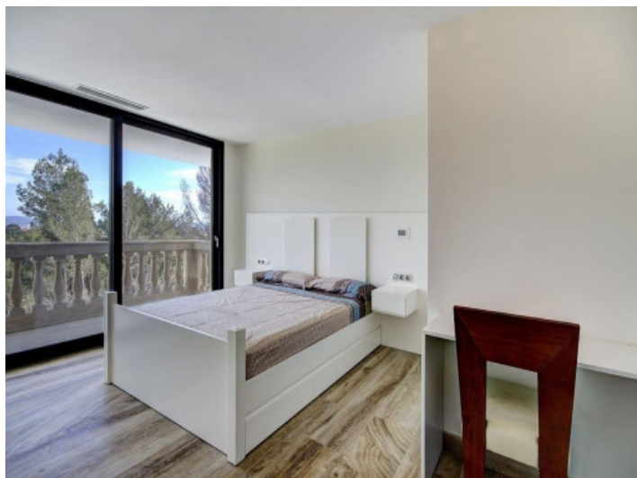
Double bedroom with access to the balcony