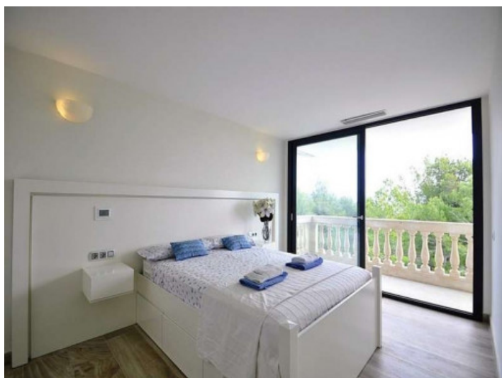
Bedroom with views on the surroundings