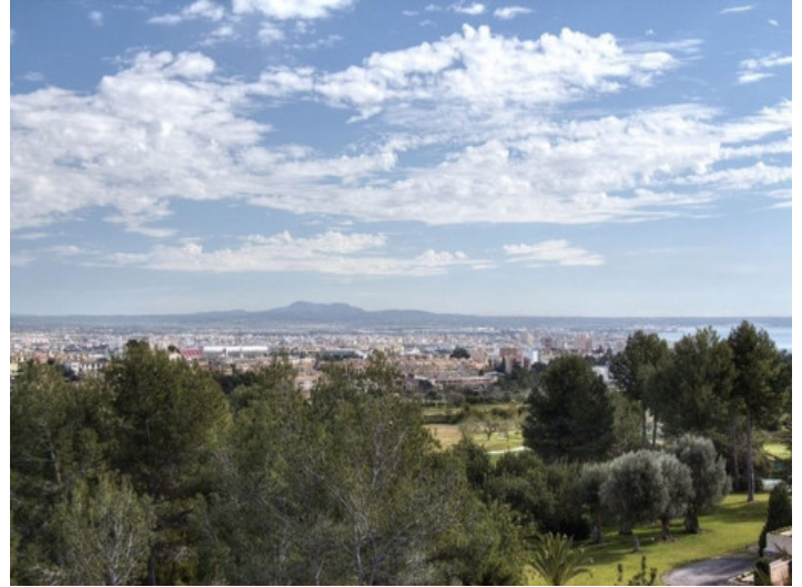
Wide landscape and sea views