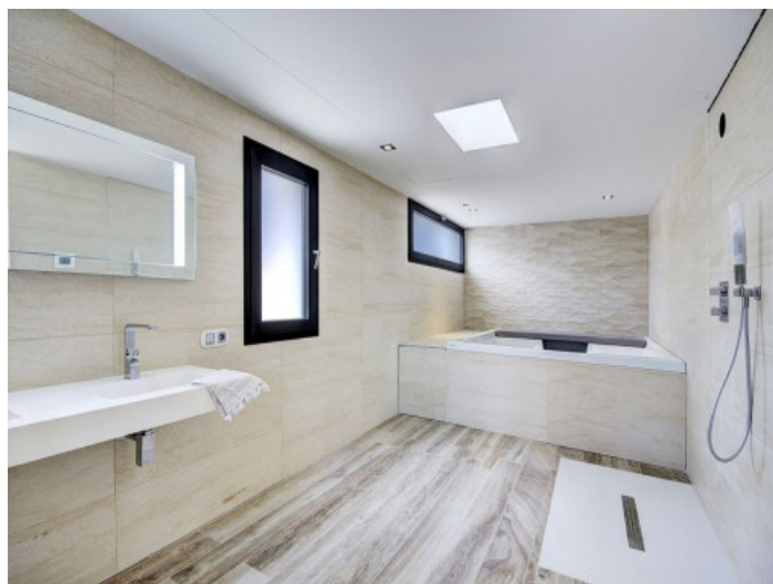
Bathroom with natural light

All information is correct to the best of our knowledge. Errors and prior sale excepted. This prospectus is purely for information purposes. Only the notarized deed of sale is legally binding.