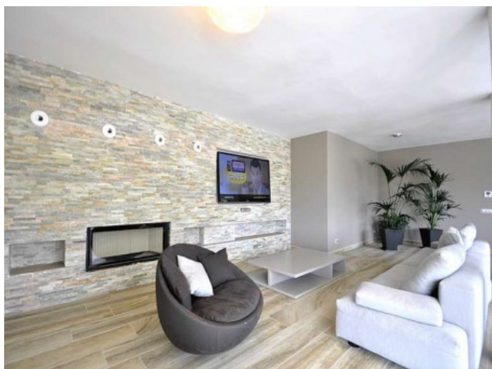
Cosy chillout area