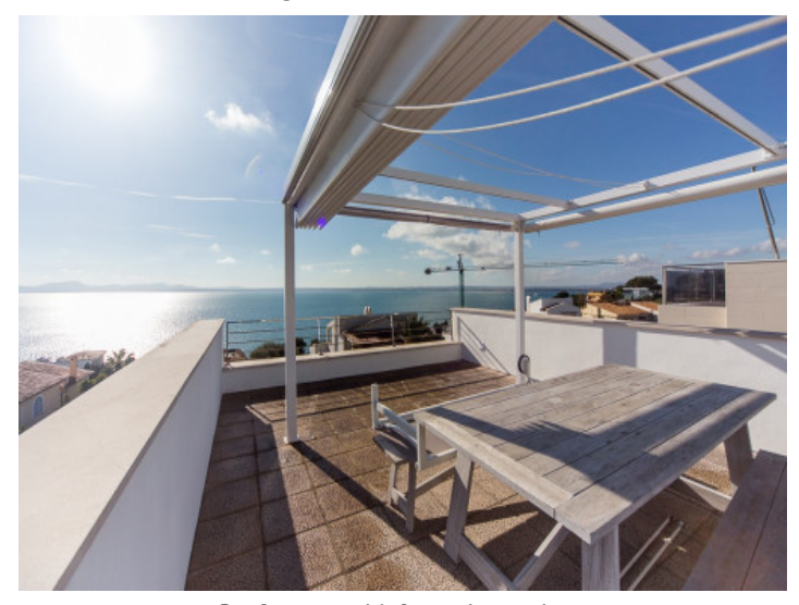
Roof terrace with fantastic sea views