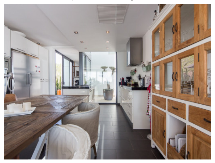
Dining area with kitchen views