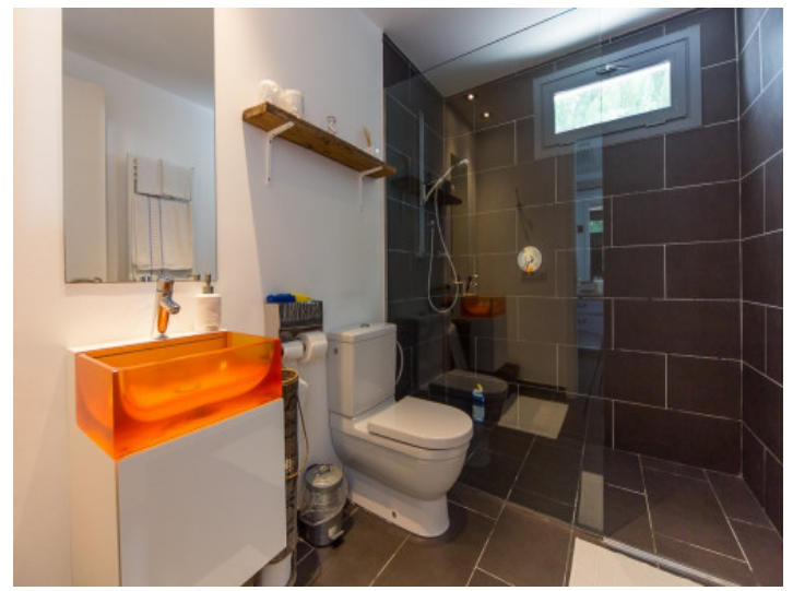
Bathroom with shower and daylight