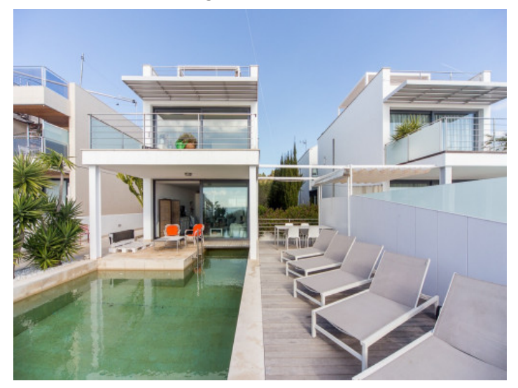
Views from the pool to the villa