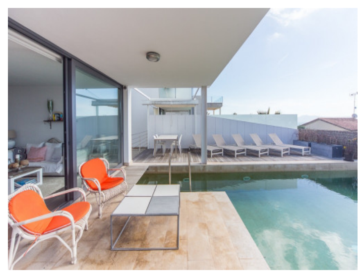
Lounge area on the terrace