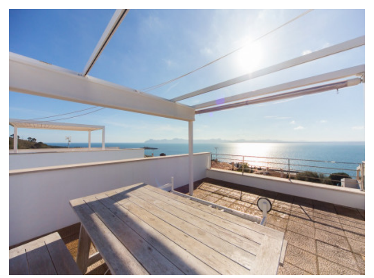
Dining area on the roof terrace