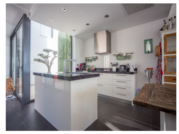
Kitchen with patio views