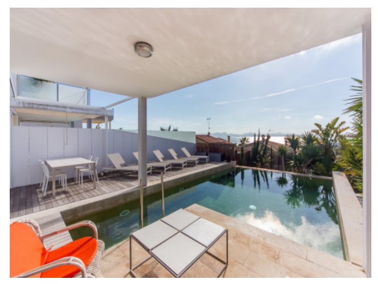
Covered terrace with pool views