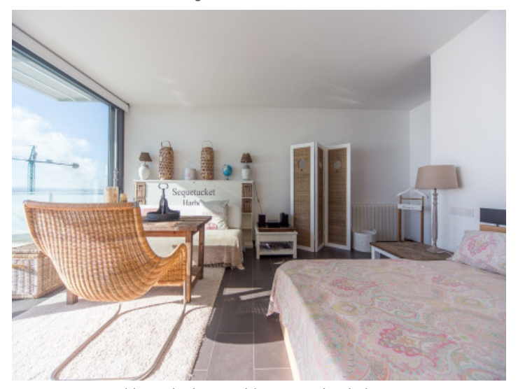
Master bedroom with panoramic windows