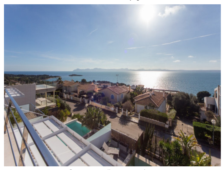
Gorgeous mediterran sea views