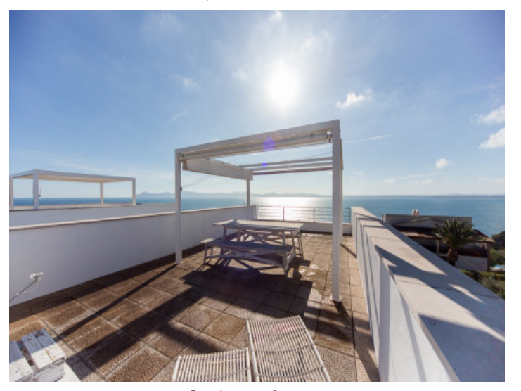
Spacious roof terrace