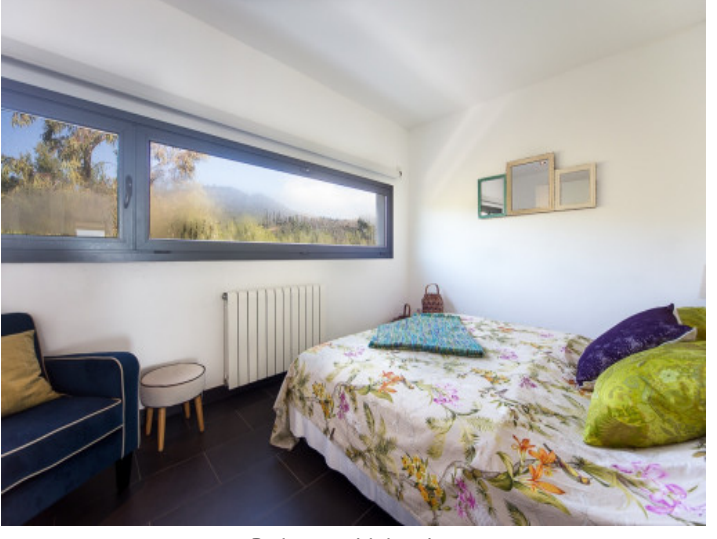
Bedroom with heating