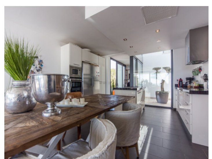
Elegant dining area with kitchen