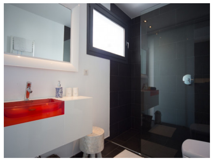
Bathroom with daylight