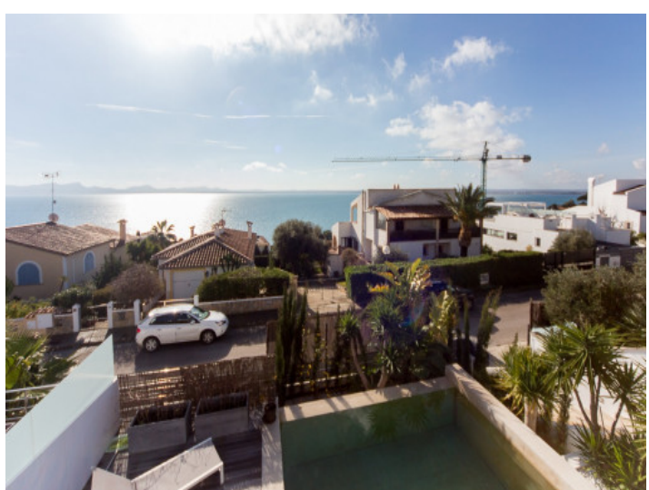
Impressive sea views