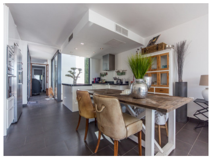
Open kitchen and dining area