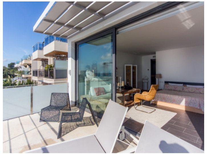
Views from the terrace to the living area