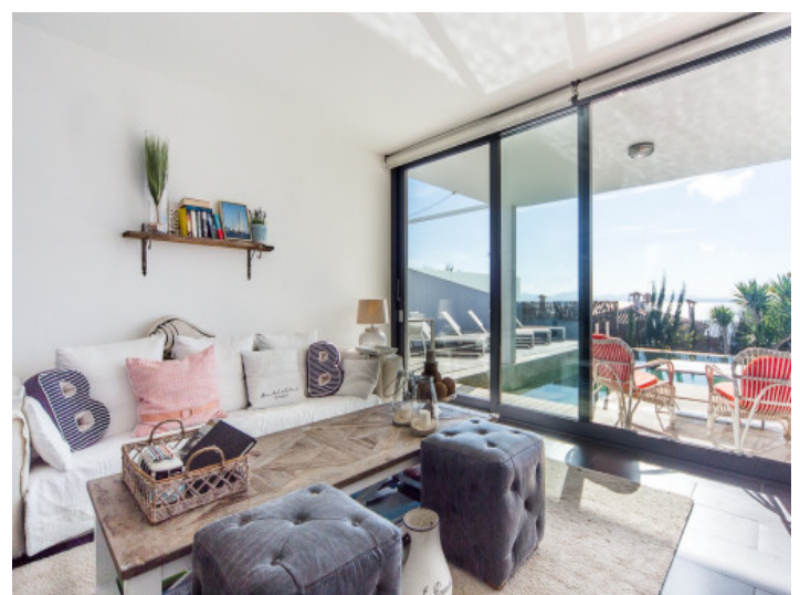
Living area with terrace