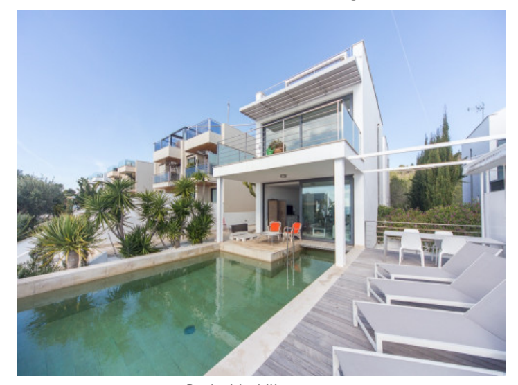
Pool with chill-out area