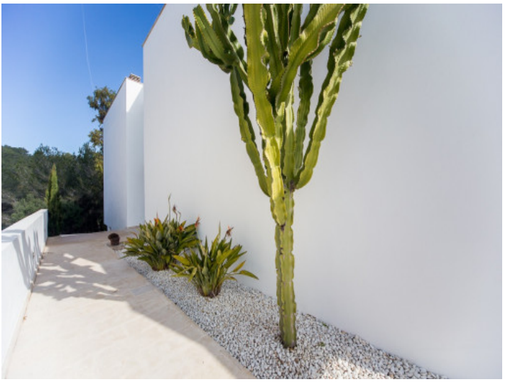
Small way surrounds the villa