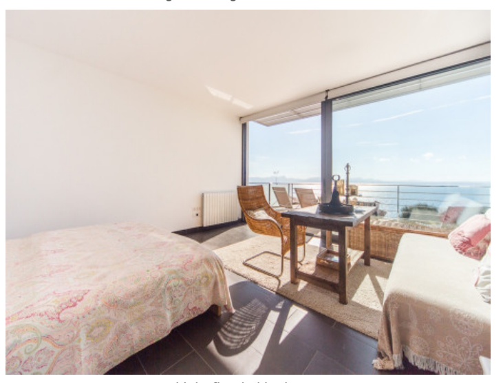
Light flooded bedroom