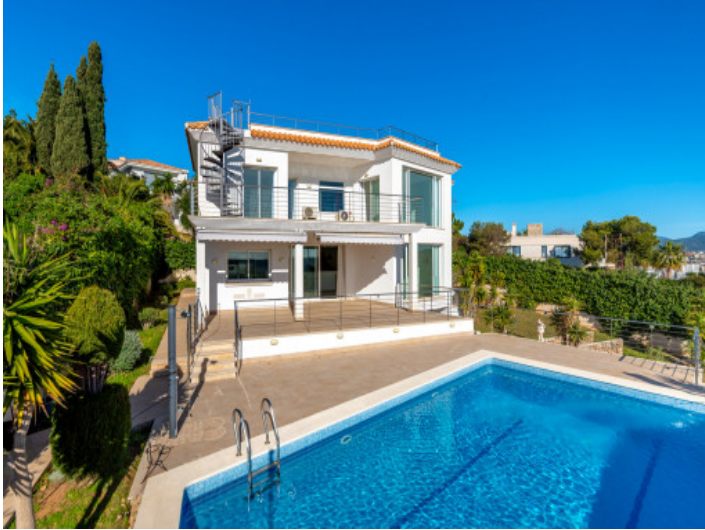
Villa with pool