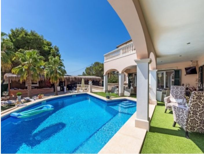
Views from covered terrace to the pool area