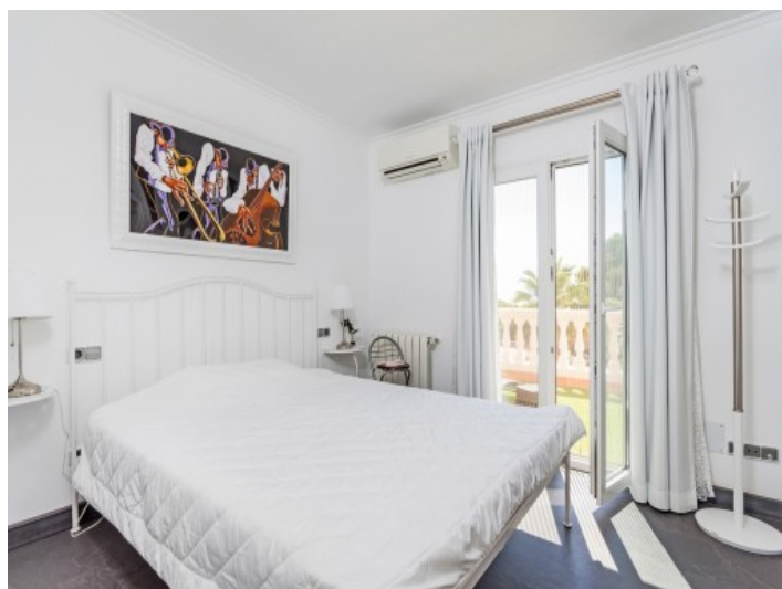
Bedroom with panoramic windows