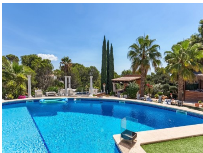
Mallorquin pool area

All information is correct to the best of our knowledge. Errors and prior sale excepted. This prospectus is purely for information purposes. Only the notarized deed of sale is legally binding.