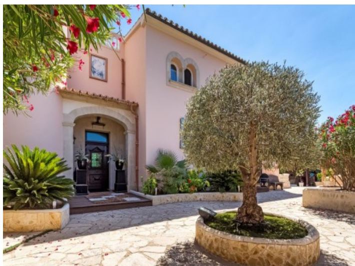
Entrance from the villa