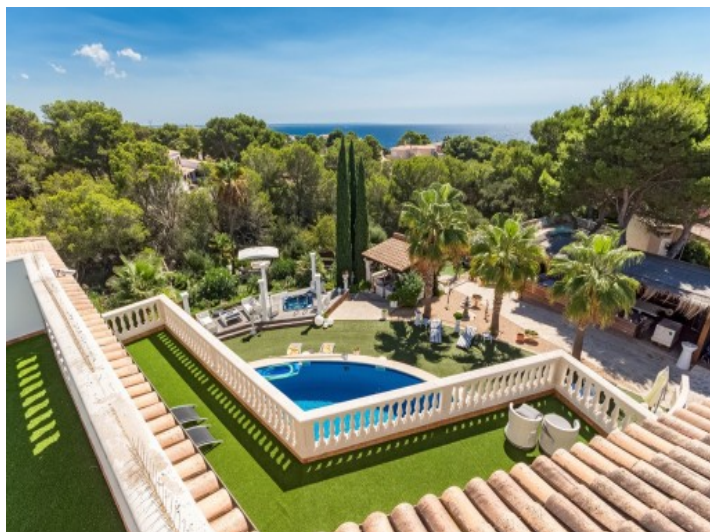
Views from the villa over the plot