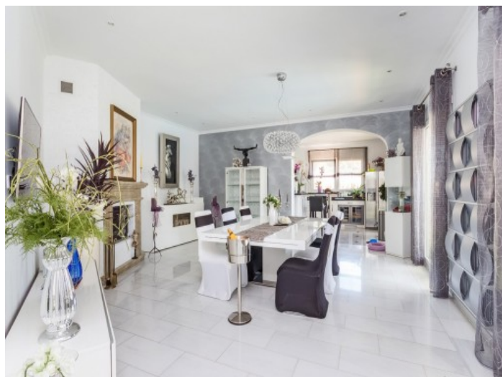
Impressive dining area

All information is correct to the best of our knowledge. Errors and prior sale excepted. This prospectus is purely for information purposes. Only the notarized deed of sale is legally binding.