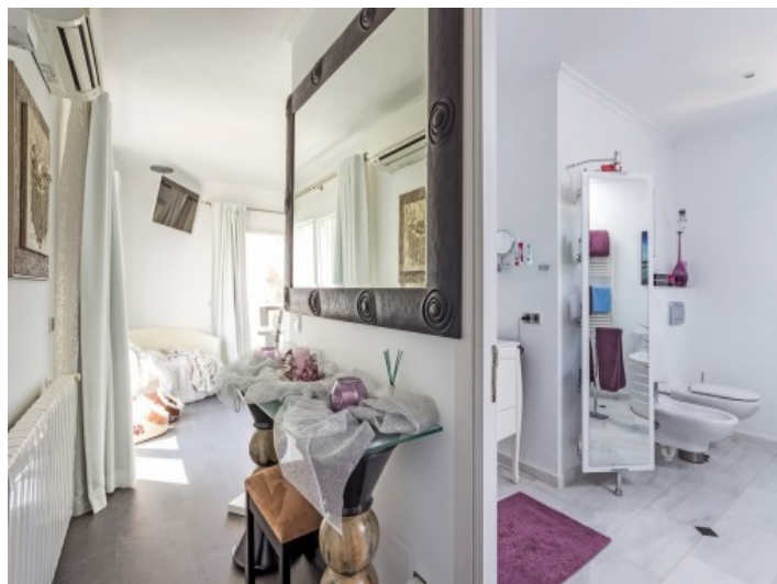
Views to the bathroom en suite from the bedroom