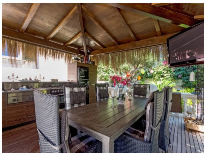
Fantastic summer kitchen