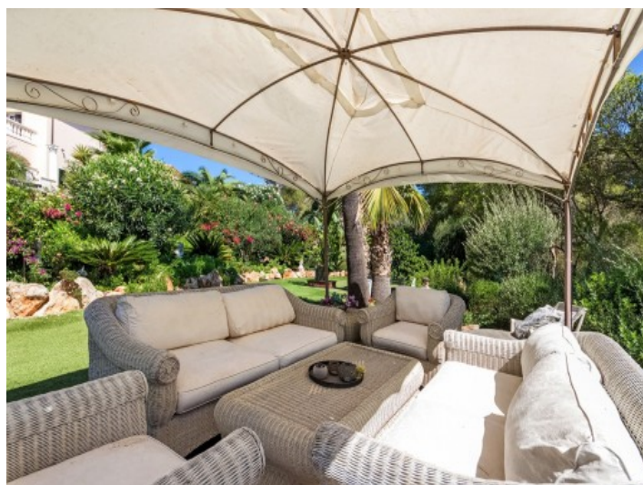
Covered lounge area