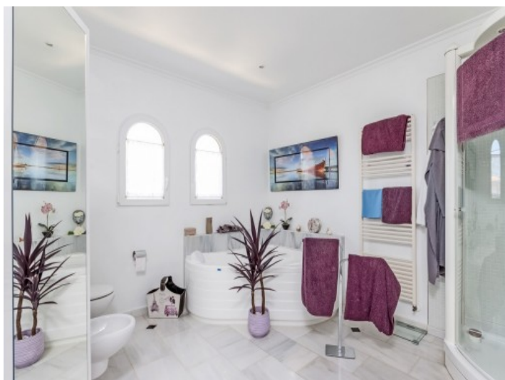
Bathroom with bathtub and shower