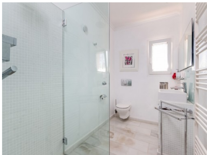
Bathroom with daylight and shower

All information is correct to the best of our knowledge. Errors and prior sale excepted. This prospectus is purely for information purposes. Only the notarized deed of sale is legally binding.