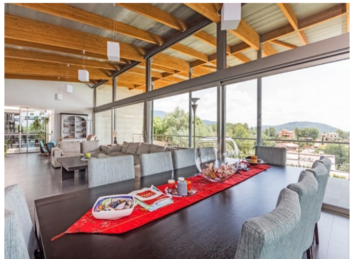
Open dining and living area with fantastic views

All information is correct to the best of our knowledge. Errors and prior sale excepted. This prospectus is purely for information purposes. Only the notarized deed of sale is legally binding.