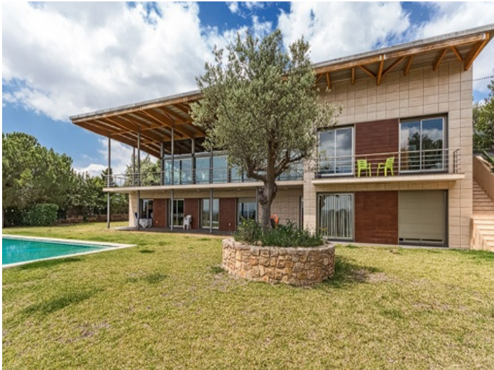
Located on the top of a hill