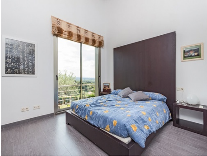
Bright master bedroom