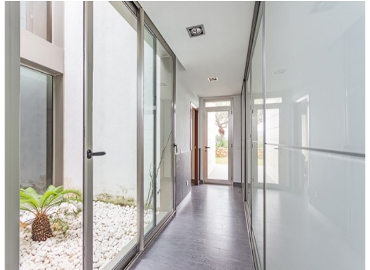
Corridor with panoramic windows on the ground floor