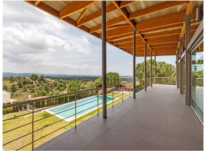
Covered terrace with panoramic views