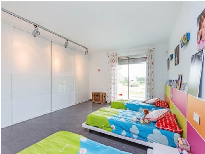
Spacious bedroom with built-in wardrobe