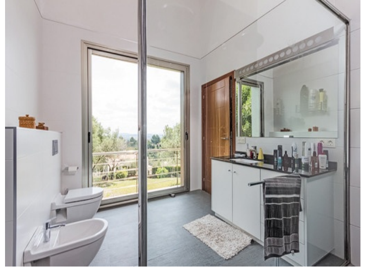
Master bathroom with large windows