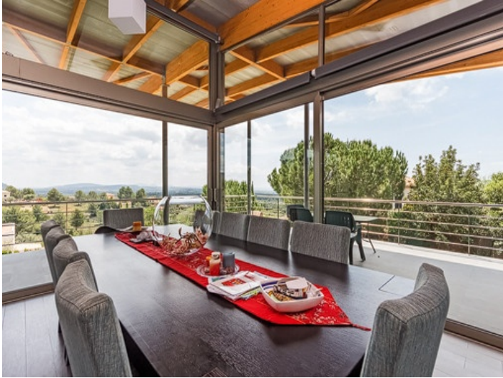
Inviting dining area with spectacular views of the surrounding