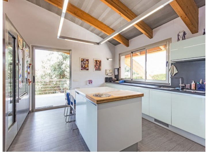
Modern kitchen with cooking island