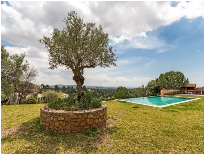
Well-tended garden with pool area