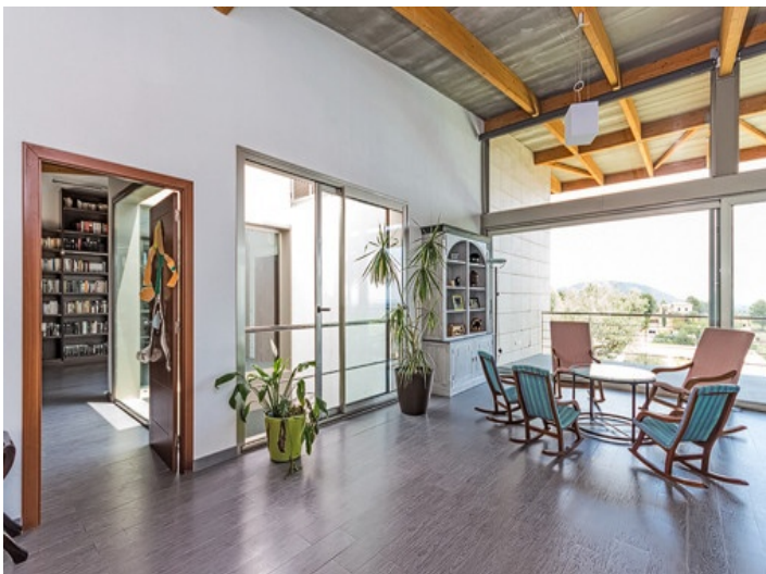
Living area beside the kitchen