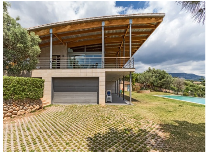
Access to the garage

All information is correct to the best of our knowledge. Errors and prior sale excepted. This prospectus is purely for information purposes. Only the notarized deed of sale is legally binding.