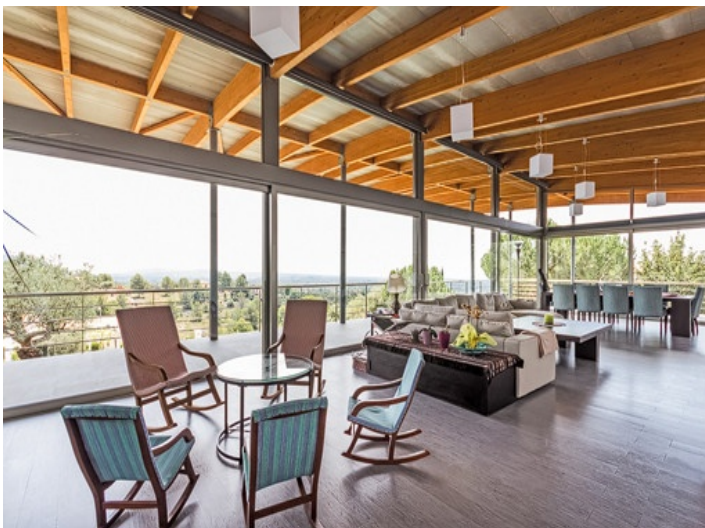
Light-flooded living and dining area with panoramic windows