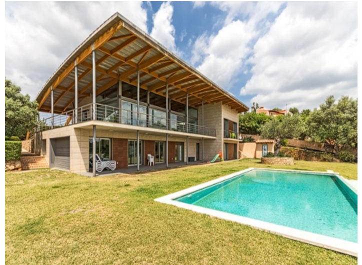
Exterior view of the luxury villa