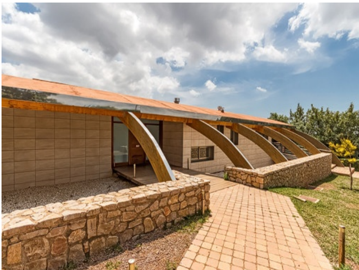
Interestingly designed entrance