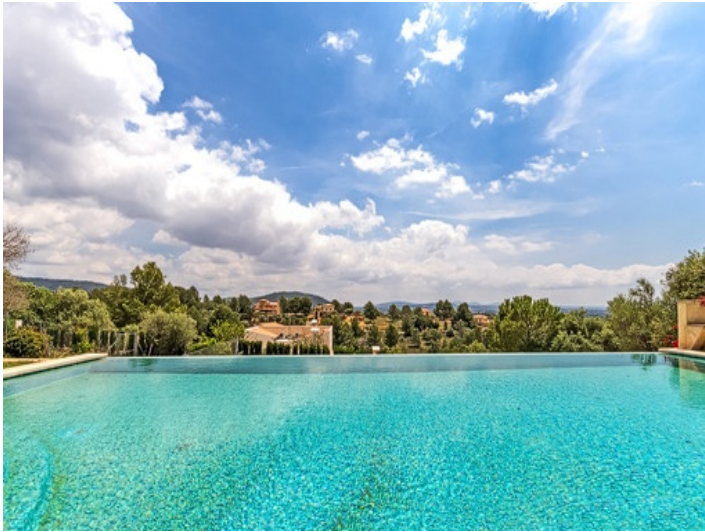
Impressive views from the pool