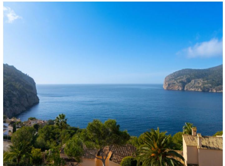
Mediterran sea views