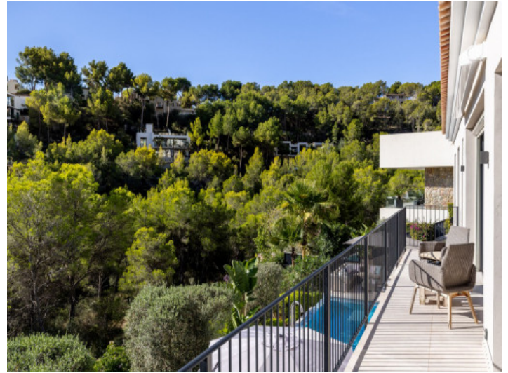
Very nice views