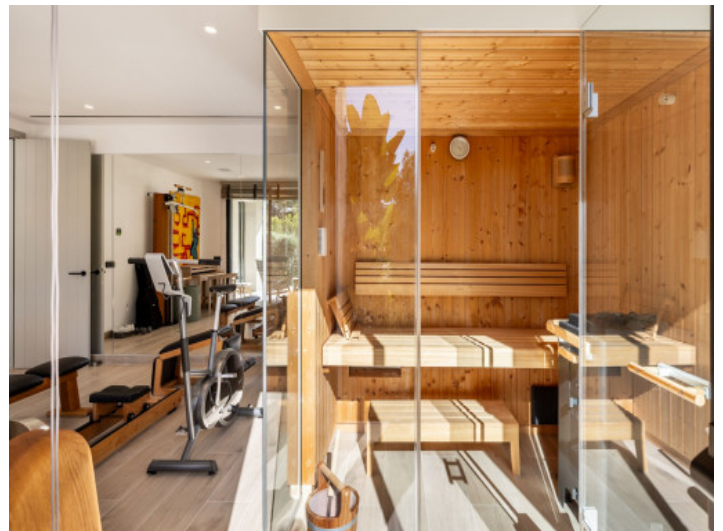
Sauna and fitness area