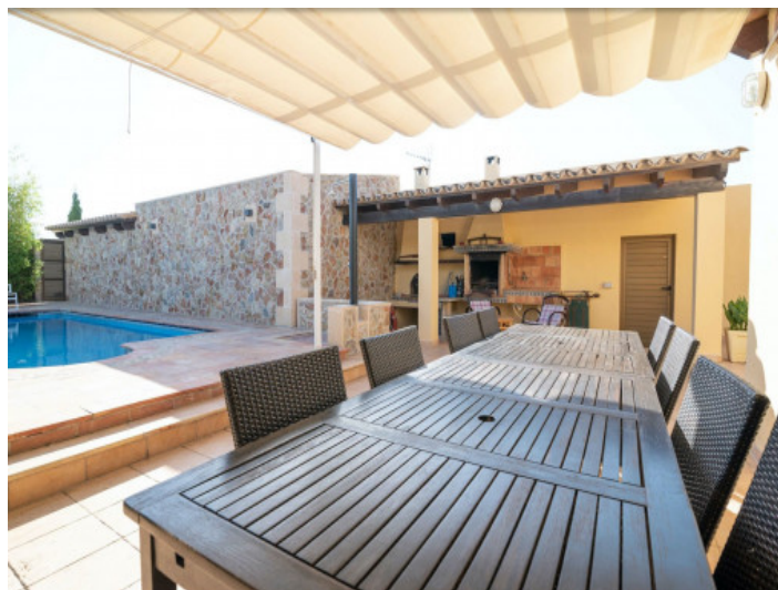
Terrace with dining area