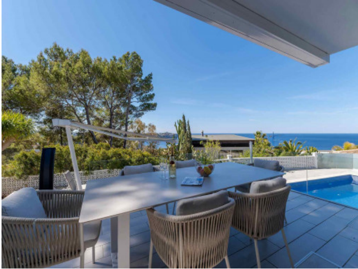
Terrace and pool area