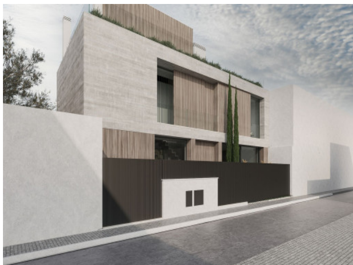
View from the street