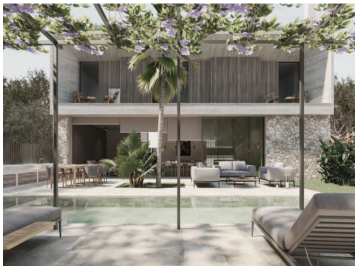
Outdoor area and pool