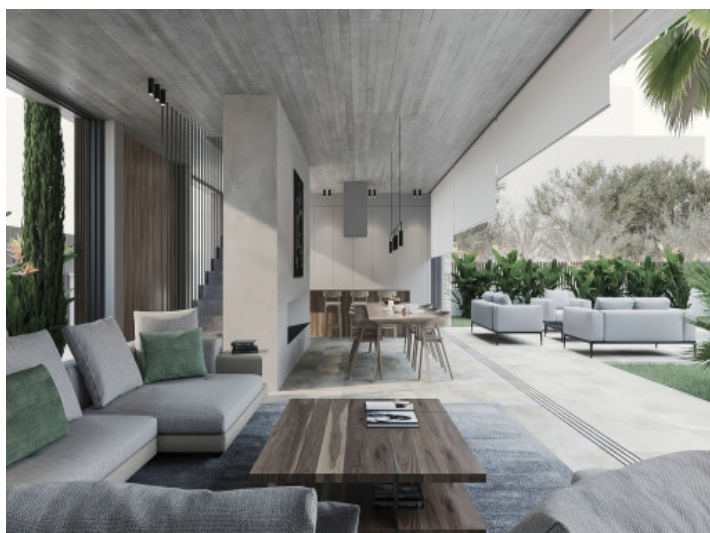
Living area and terrace