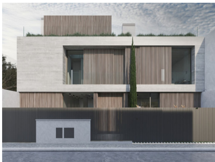
View from the street