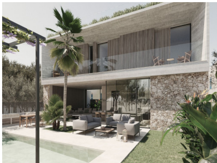
Outdoor area and pool