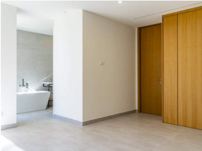
Bedroom and bathroom