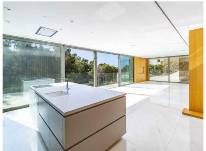
Open living and kitchen area