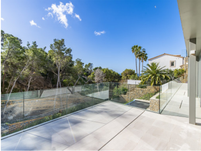
Terrace with sea views