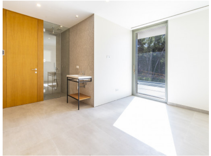
Bedroom and bathroom