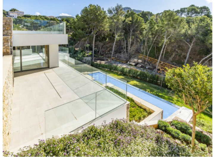
Upper terrace and pool