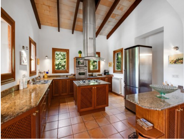
Rustic kitchen with cooking island