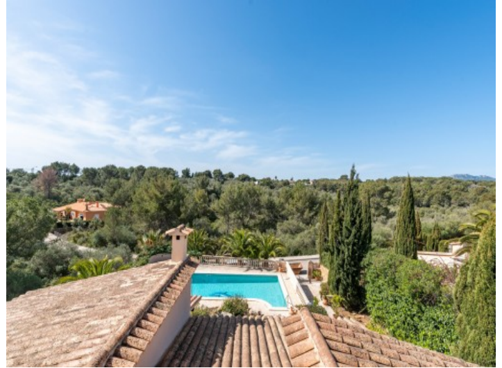
View from the upper floor