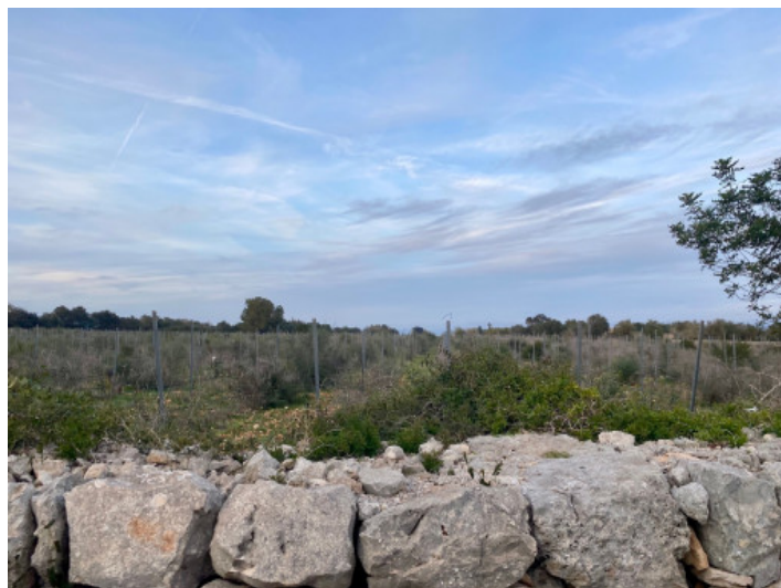
Plot with wonderful views