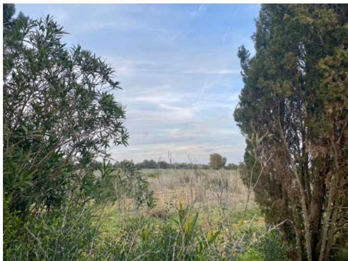
Plot with vineyards