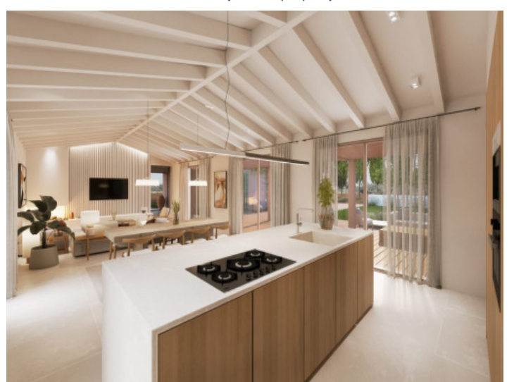
Living, dining and kitchen area Mastersuite All information is correct to the best of our knowledge. Errors and prior sale excepted. This prospectus is purely for information purposes. Only the notarized deed of sale is legally binding.

PORTA MALLORQUINA • C./ CONQUISTADOR 8, 07001 PALMA TEL. +34 971 698 242 • INFO@PORTAMALLORQUINA.COM