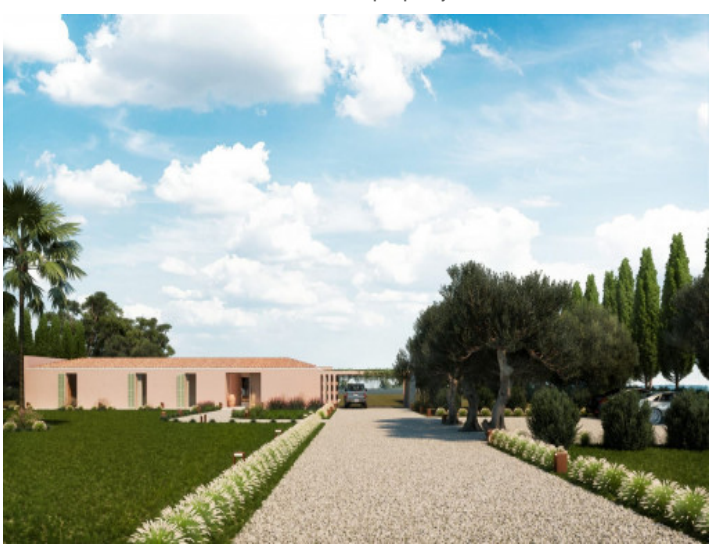
Driveway to the property