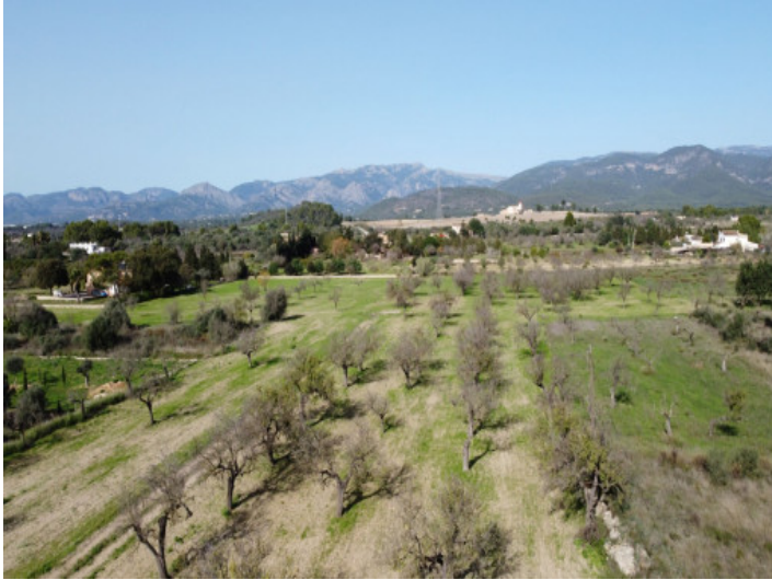
Plot with Tramuntana views