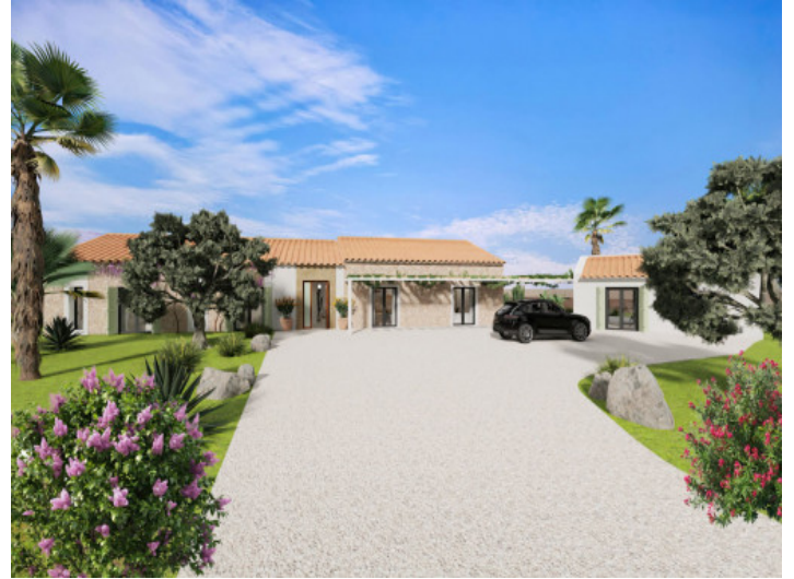
Beautiful construction project