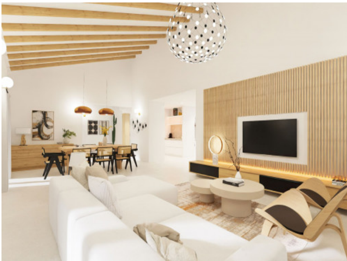
Living and dining area