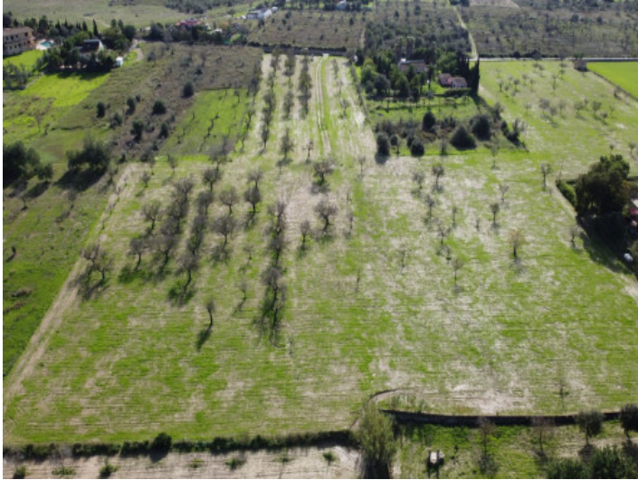
Plot of 22.000sqm