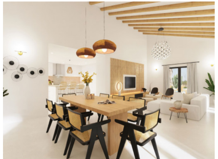
Bright dining area