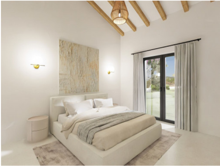
One of 4 planned bedrooms