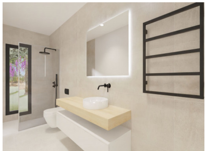
One of 3 bathrooms

All information is correct to the best of our knowledge. Errors and prior sale excepted. This prospectus is purely for information purposes. Only the notarized deed of sale is legally binding.