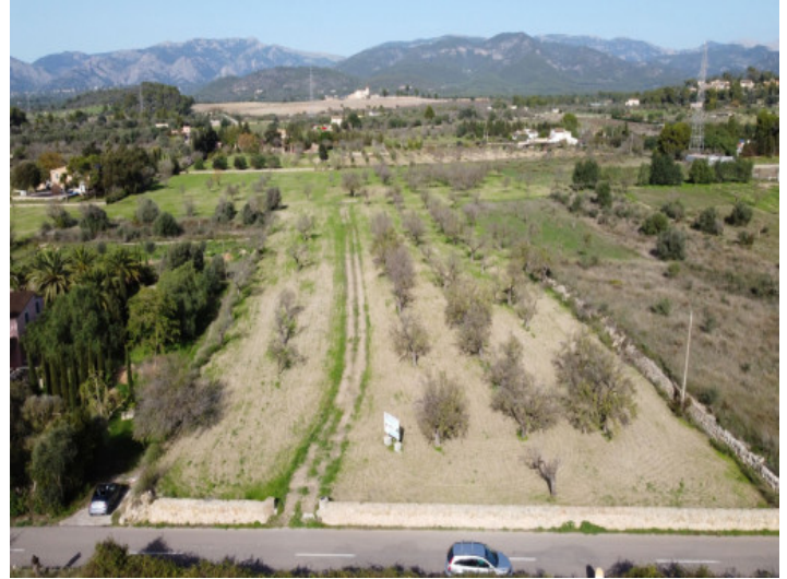
Turnkey construction project