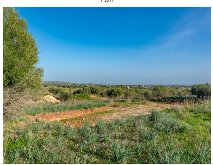
Plot with sea views