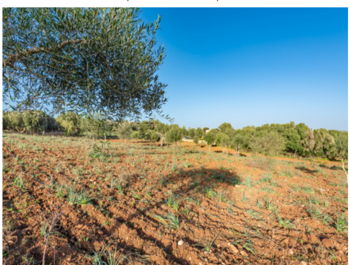
Plot with building project