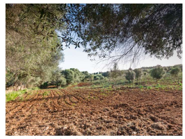
A construction project for a country house with pool