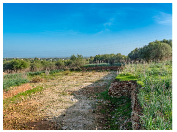
Plot with seaviews