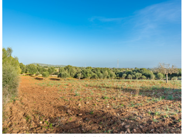
An approx. 69 sqm pool with adjoining sun terrace is planned

All information is correct to the best of our knowledge. Errors and prior sale excepted. This prospectus is purely for information purposes. Only the notarized deed of sale is legally binding.