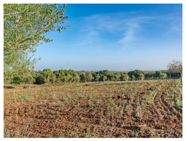
Flat building plot