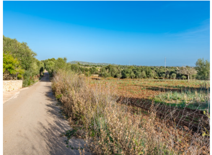
Asphalted road to the plot