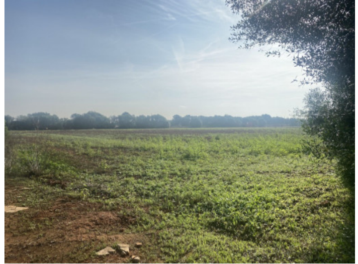
Plot with construction project