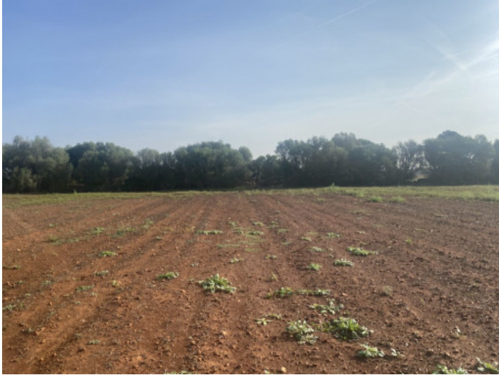
Plot with views