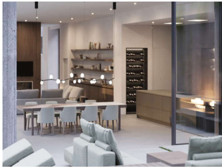
Living area Dining area All information is correct to the best of our knowledge. Errors and prior sale excepted. This prospectus is purely for information purposes. Only the notarized deed of sale is legally binding.

PORTA MALLORQUINA • C./ CONQUISTADOR 8, 07001 PALMA TEL. +34 971 698 242 • INFO@PORTAMALLORQUINA.COM