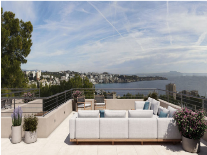
Comfortable rooftop terrace