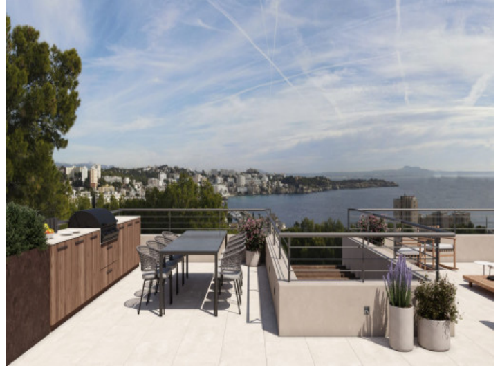
Rooftop with amazing view