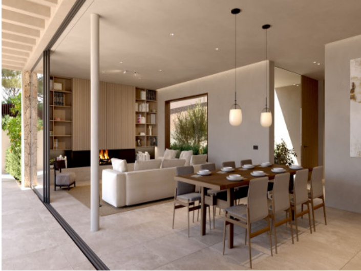
Bright living and dining room