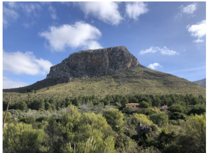
views to the Mont Ferrutz