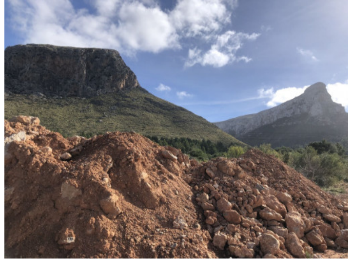
You can built a family home