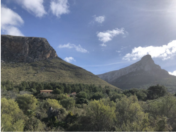
Beautiful nature is surrounding the plot