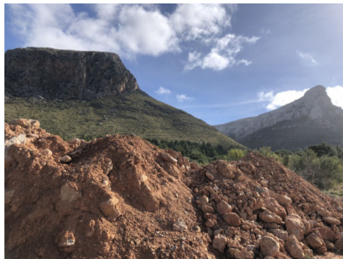
You can built a family home