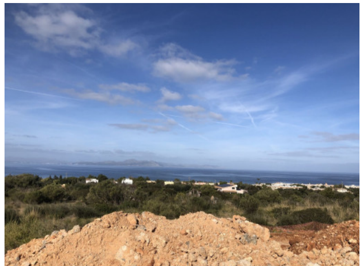
Views over Colonia St. pere up to the sea

All information is correct to the best of our knowledge. Errors and prior sale excepted. This prospectus is purely for information purposes. Only the notarized deed of sale is legally binding.