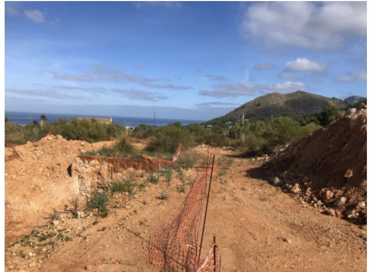
Colonia St. pere is close to Artà