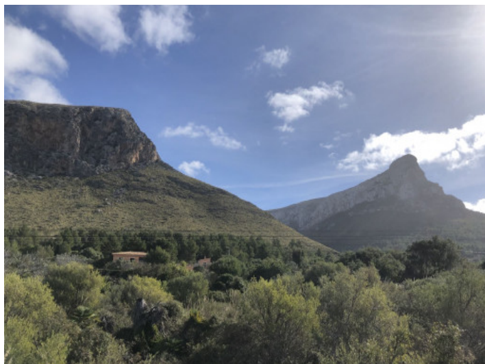
Beautiful nature is surrounding the plot