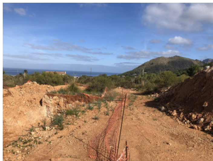
Colonia St. pere is close to Artà