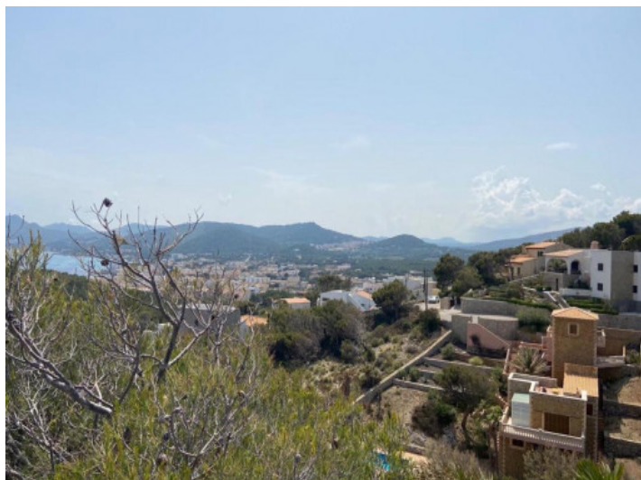
Construction plot with a view in Capdepera