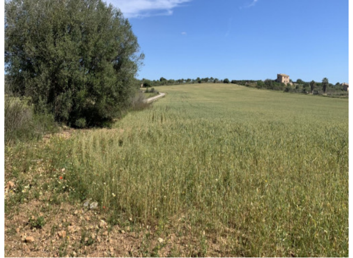
Plot with project