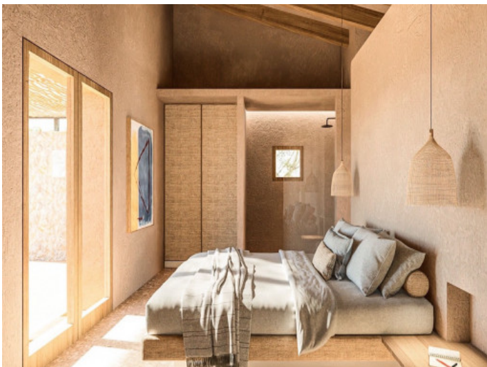
Elegant bedroom with bathroom en suite