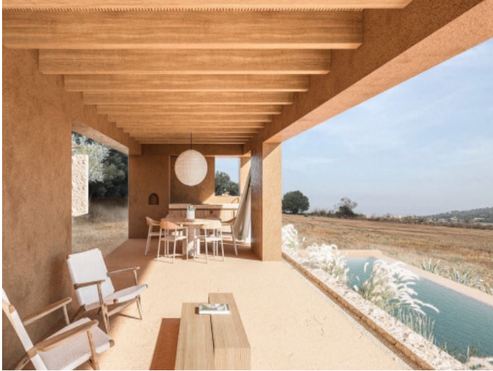
Plot with building project in Villafranca de Bonany