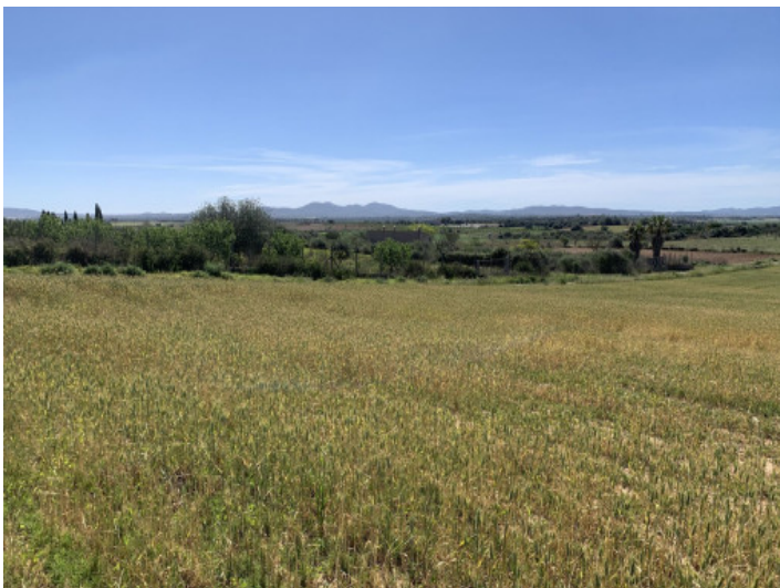
Plot with project

All information is correct to the best of our knowledge. Errors and prior sale excepted. This prospectus is purely for information purposes. Only the notarized deed of sale is legally binding.