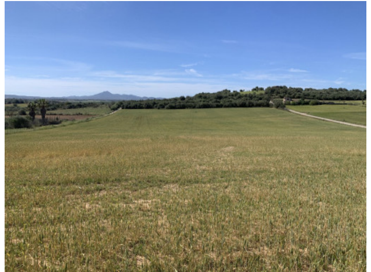
Plot with project