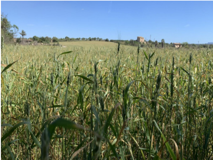
Plot with project