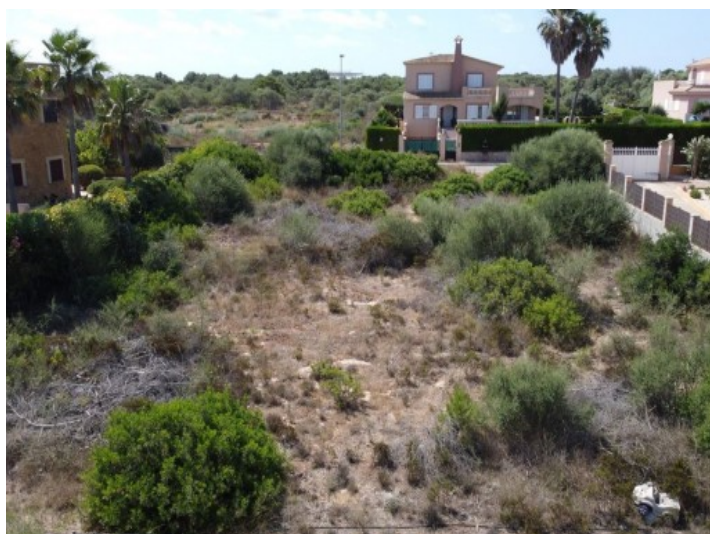
View of the property