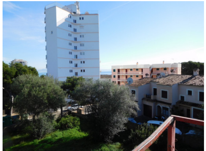
View of the surroundings

All information is correct to the best of our knowledge. Errors and prior sale excepted. This prospectus is purely for information purposes. Only the notarized deed of sale is legally binding.