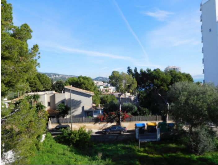
Partial sea views