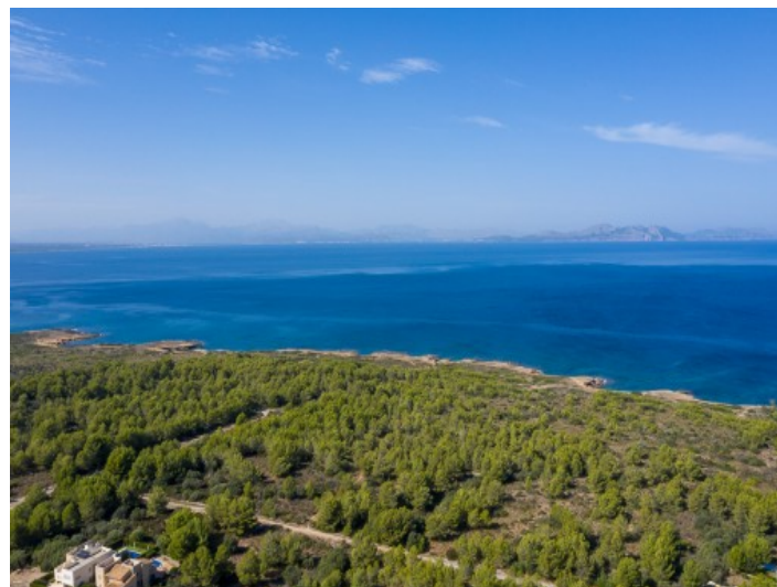
View of the coast