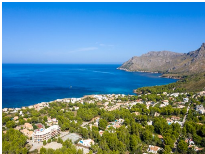
View of the coast