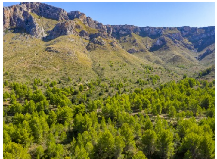
Stunning mountain views

All information is correct to the best of our knowledge. Errors and prior sale excepted. This prospectus is purely for information purposes. Only the notarized deed of sale is legally binding.