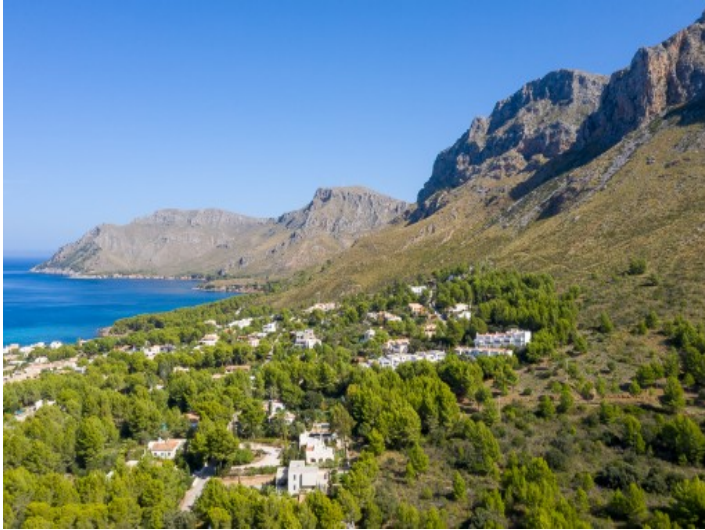
Wonderful mountain and sea views