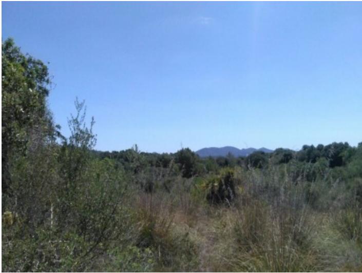
Plot with a lot of possibilities