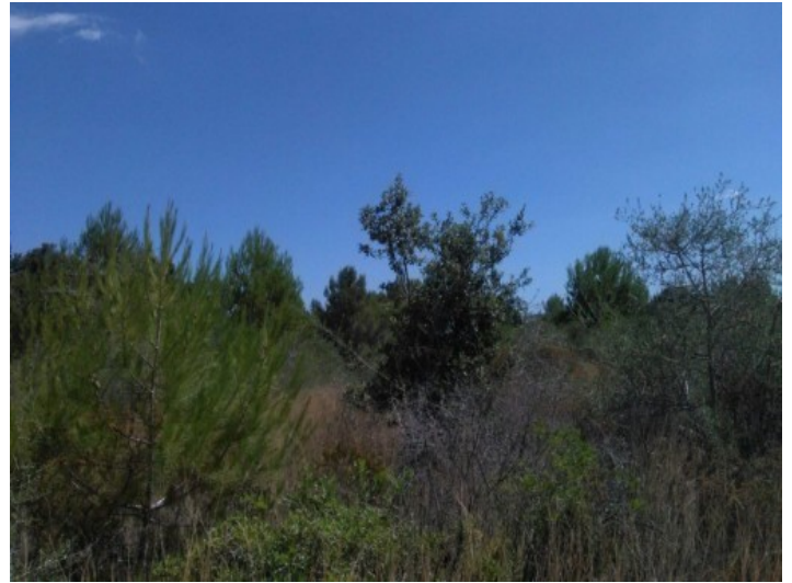
Plot in Son Servera