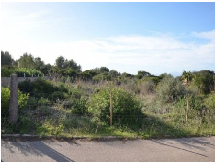
Plot in second sea line