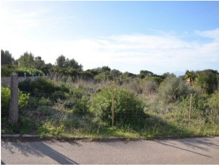
Street view of the plot