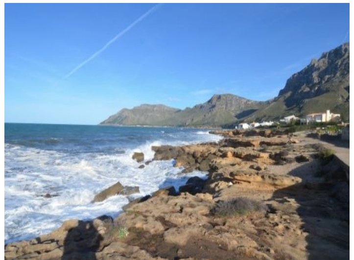
View of the coast

All information is correct to the best of our knowledge. Errors and prior sale excepted. This prospectus is purely for information purposes. Only the notarized deed of sale is legally binding.