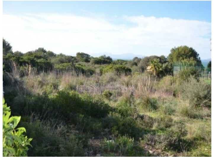
Plot of 818 sqm