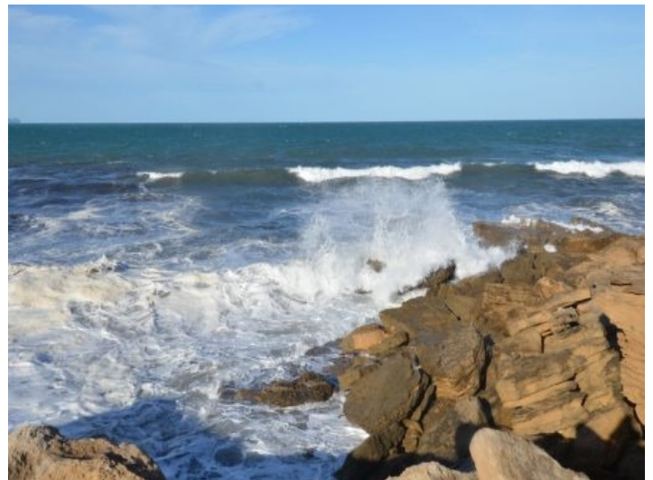
Plot near the sea