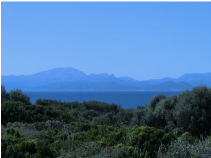
View of the bay of Alcudia