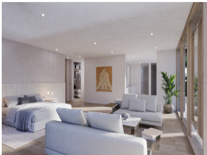
Large bedroom with seating