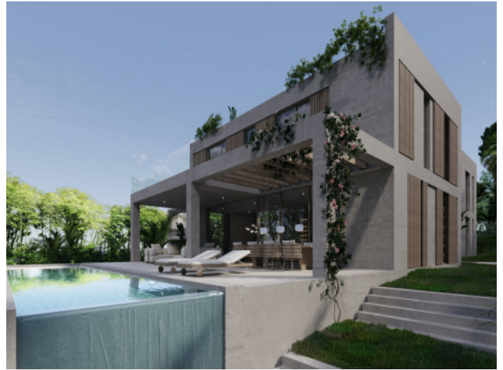
Alternative view of the project