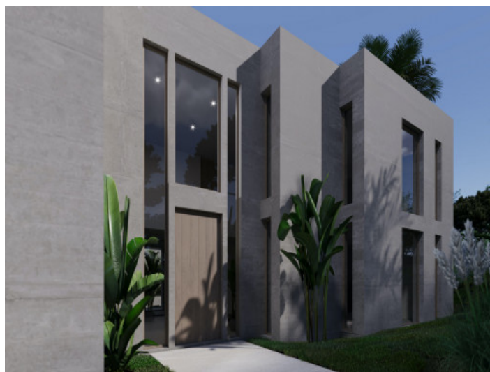
Façade of the villa

All information is correct to the best of our knowledge. Errors and prior sale excepted. This prospectus is purely for information purposes. Only the notarized deed of sale is legally binding.