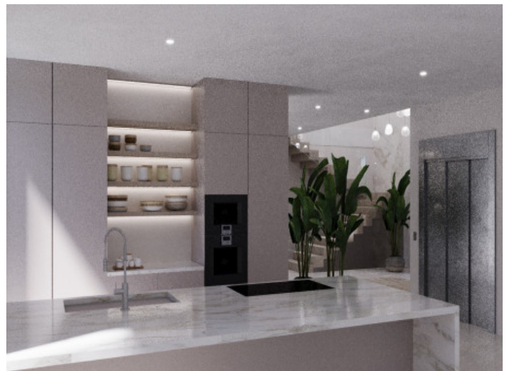
Modern, open kitchen

All information is correct to the best of our knowledge. Errors and prior sale excepted. This prospectus is purely for information purposes. Only the notarized deed of sale is legally binding.