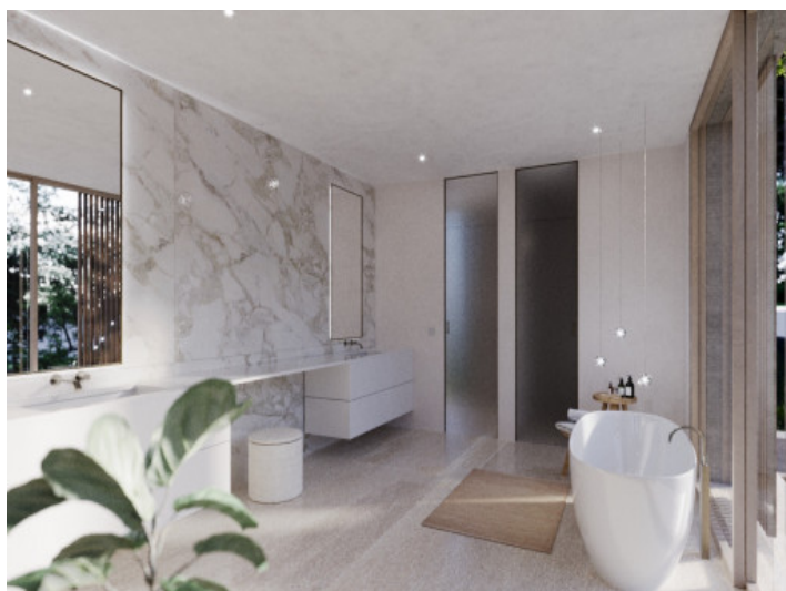
Bathroom in minimalistic design