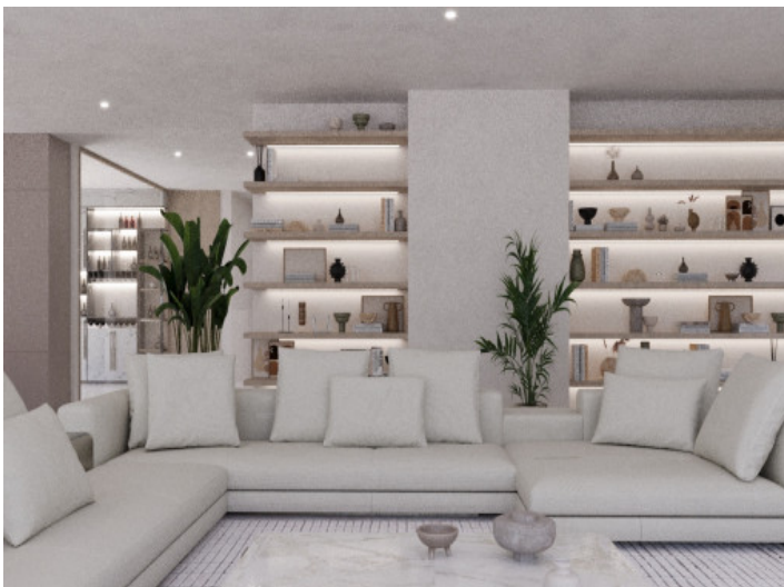
Comfortable living area