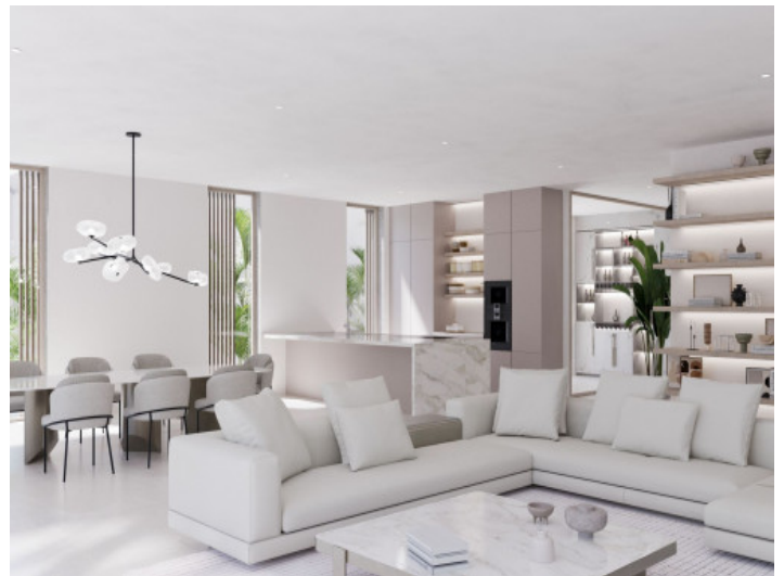
Light-flooded living and dining area