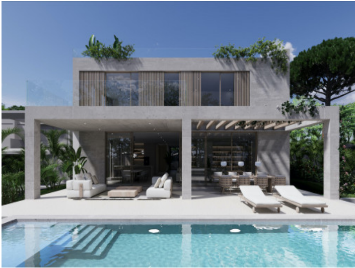
Superb pool area