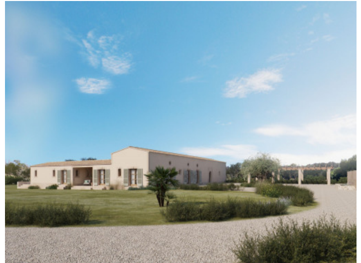
Exterior view and driveway

All information is correct to the best of our knowledge. Errors and prior sale excepted. This prospectus is purely for information purposes. Only the notarized deed of sale is legally binding.