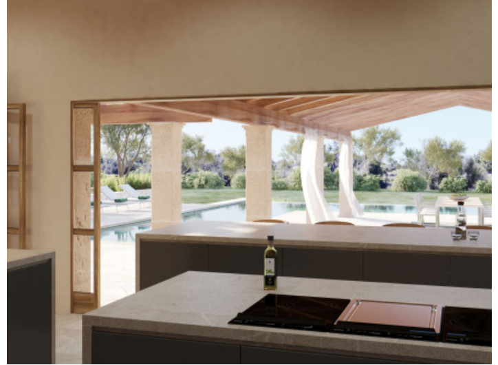
Kitchen with pool view