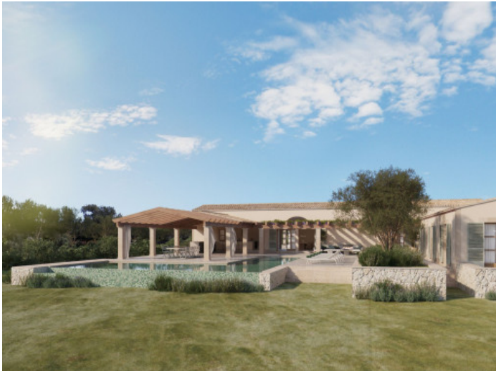
Exterior view and pool