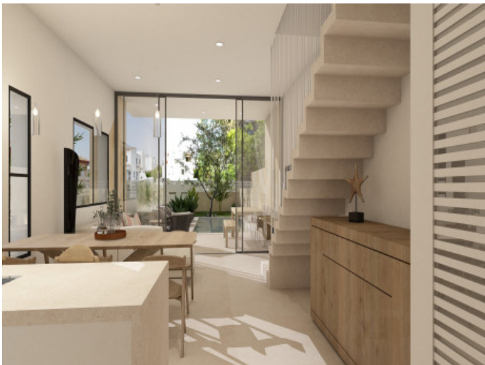
Openly-designed living and dining area