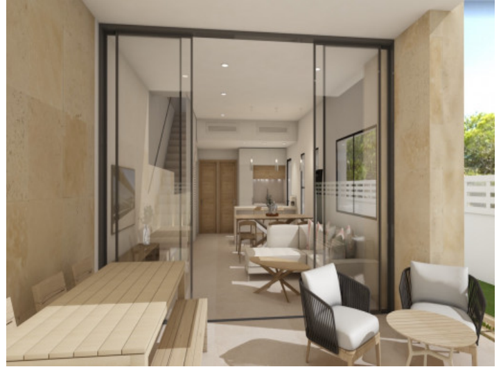
Covered terrace with inviting seating area