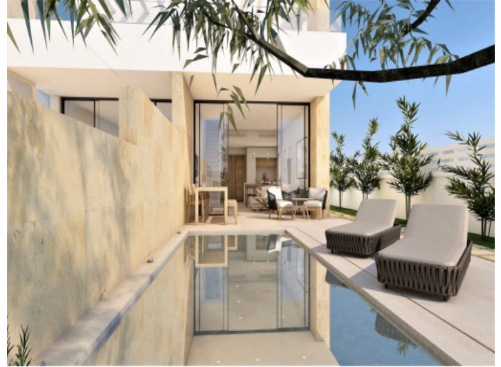
Pool with sun terrace