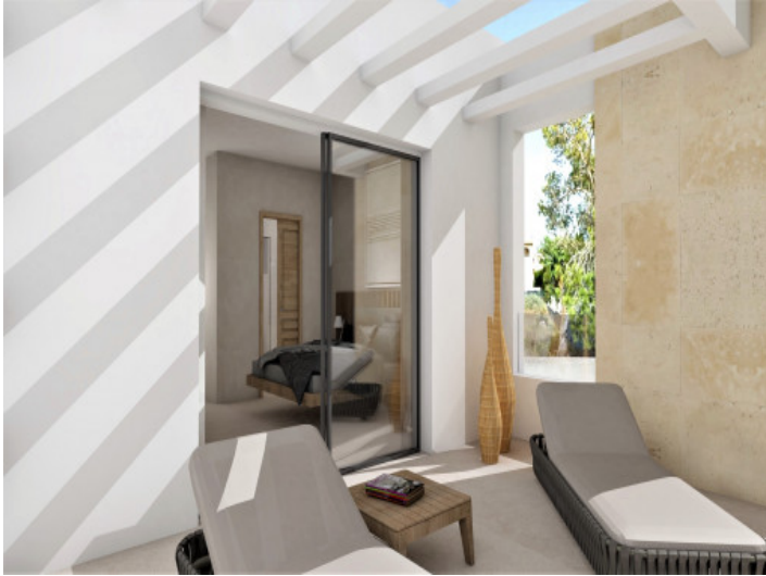
Private terrace from the master bedroom