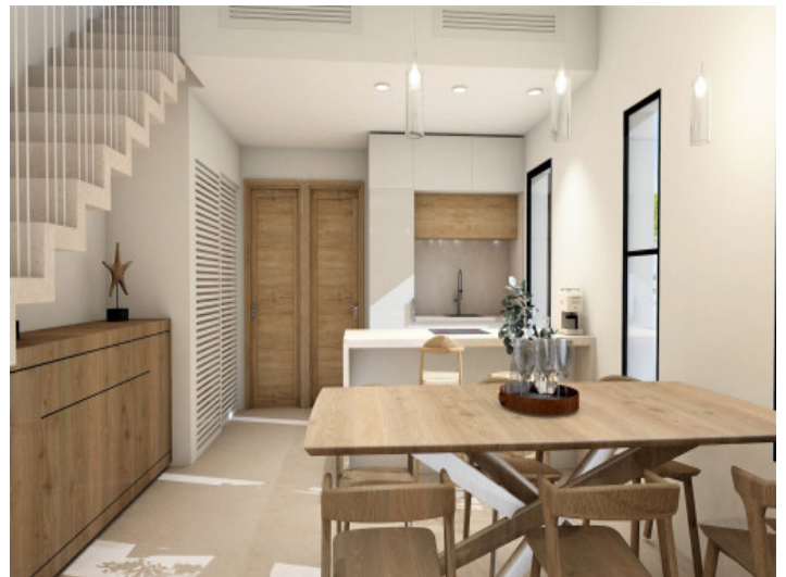
Cosy dining area with integrated kitchen