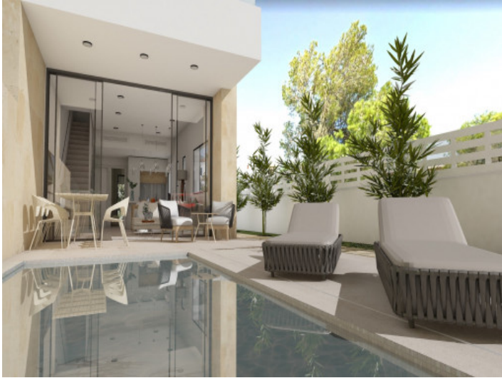
Fantastic semi-detached house with pool