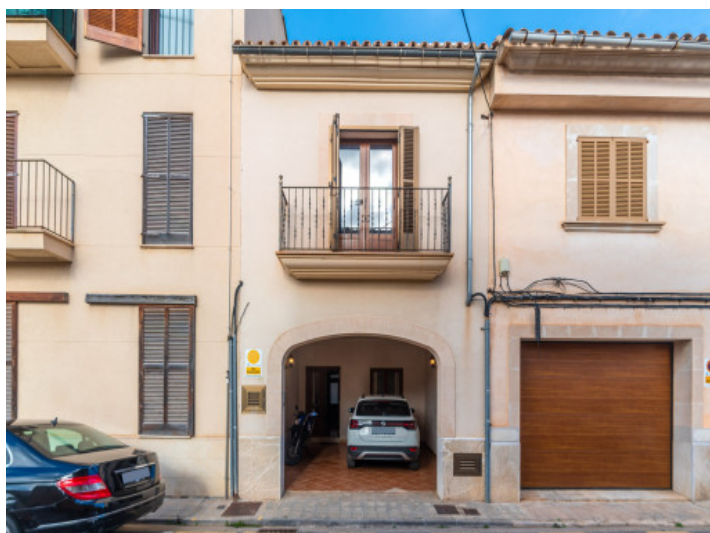
Front view and garage