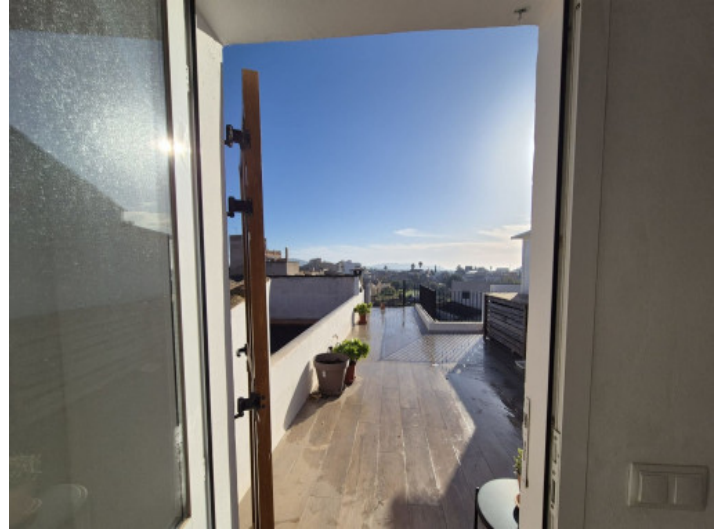
Access to the rooftop terrace