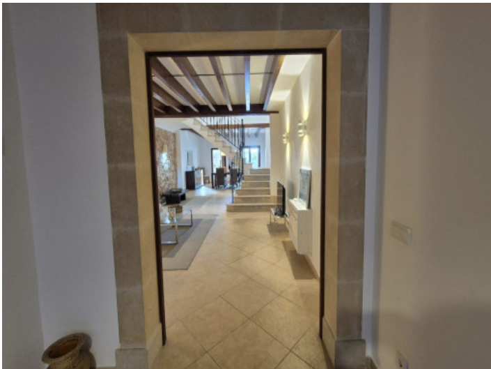
View into the living and dining area