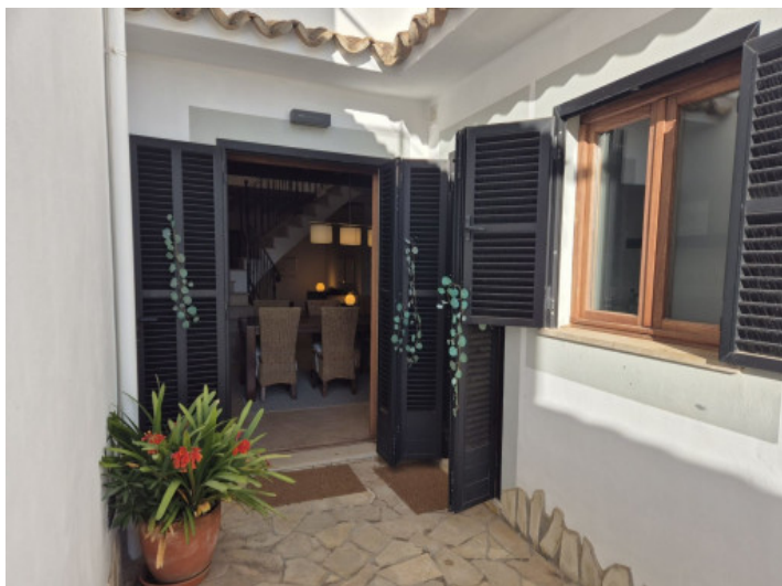
View from the patio to the dining area