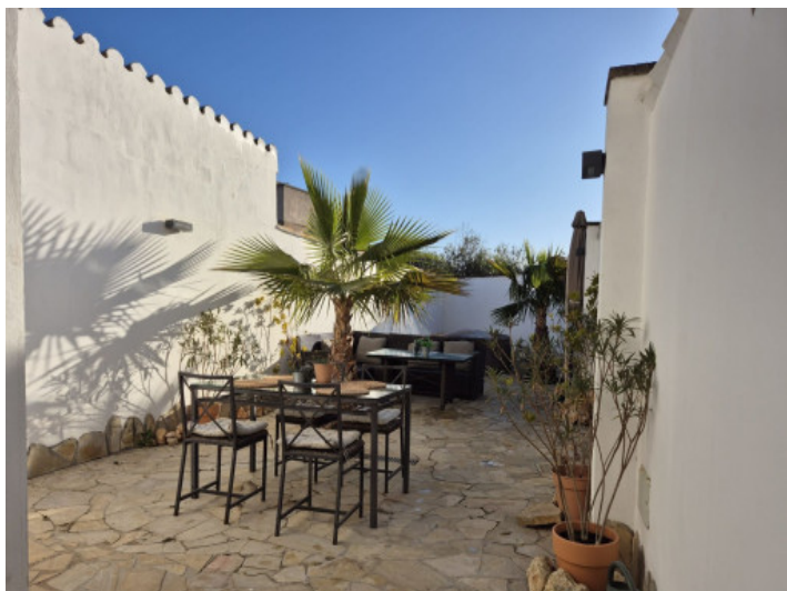
Tastefully renovated townhouse with cozy patio in Llucmajor