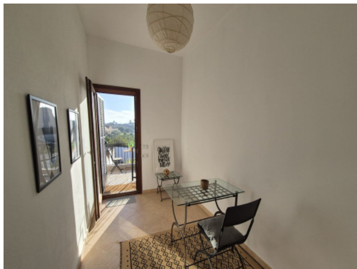
Access rooftop terrace