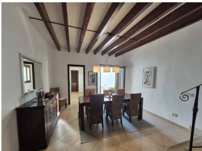
Dining area with patio access