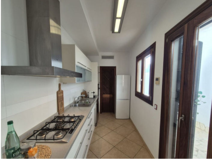
Sun flooded kitchen