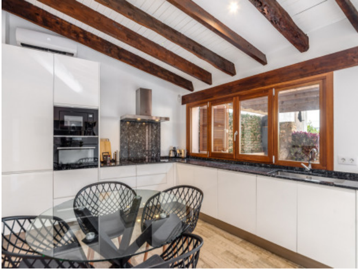
Modern, fully equipped kitchen