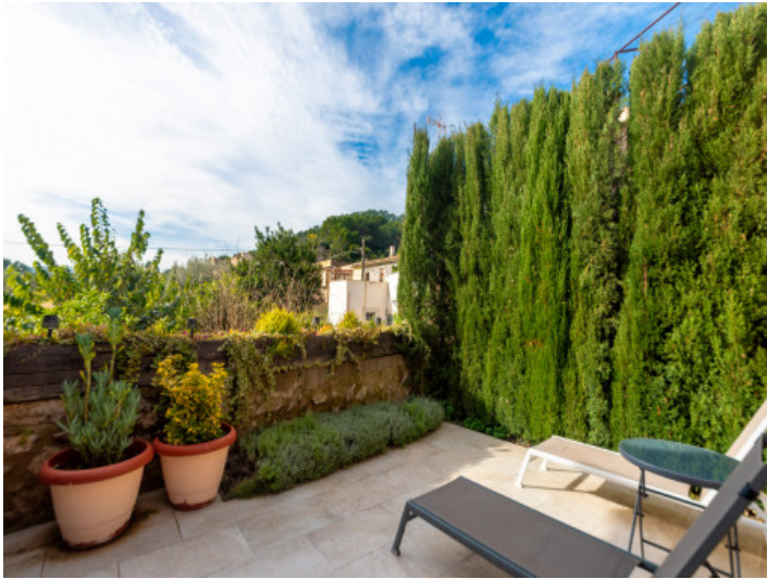
Terrace surrounded by nature