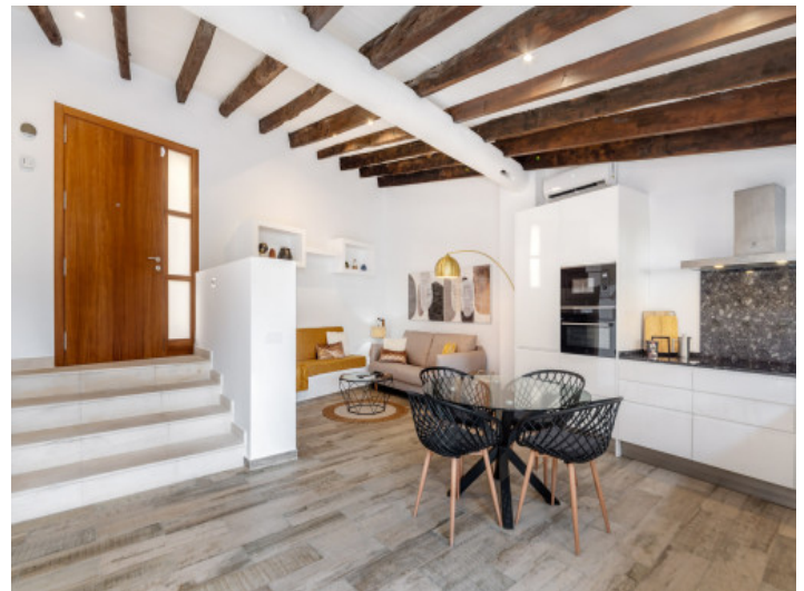
Open plan living and dining area