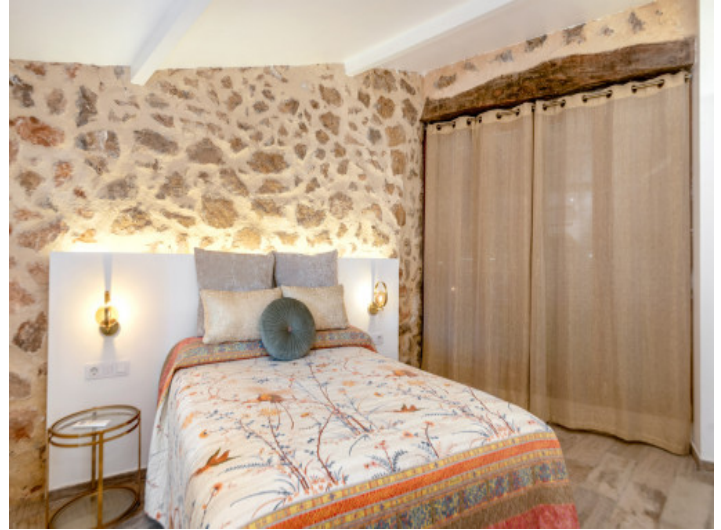
Beautiful double bedroom