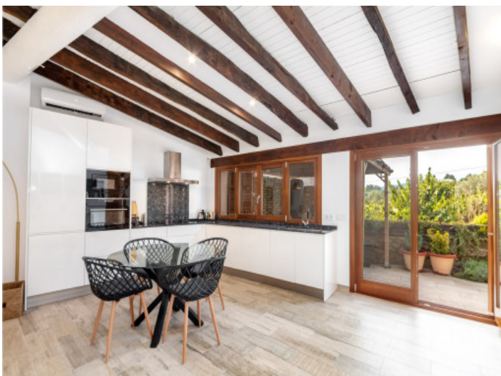
Dining area and kitchen