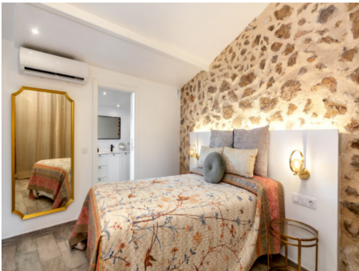
Double bedroom with bathroom en suite