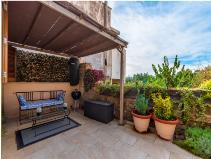
Partially covered terrace