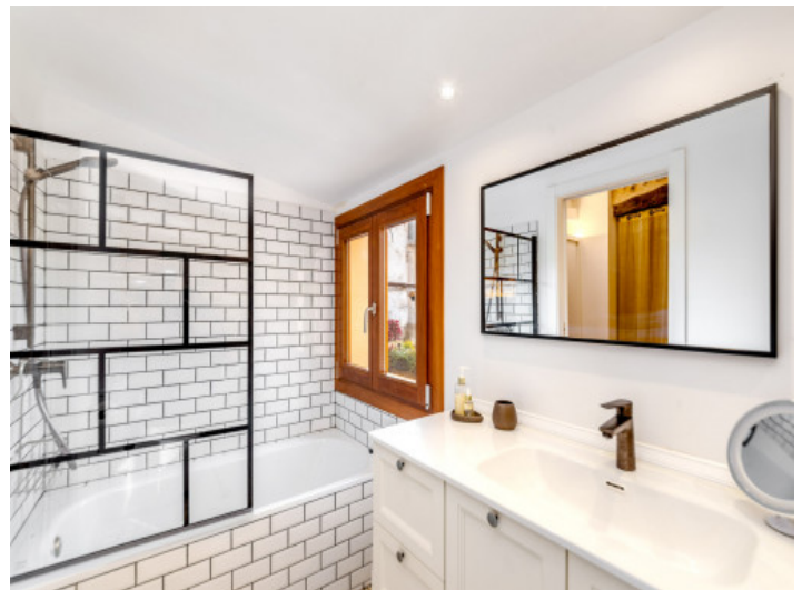
Lovely bathroom with bathtub