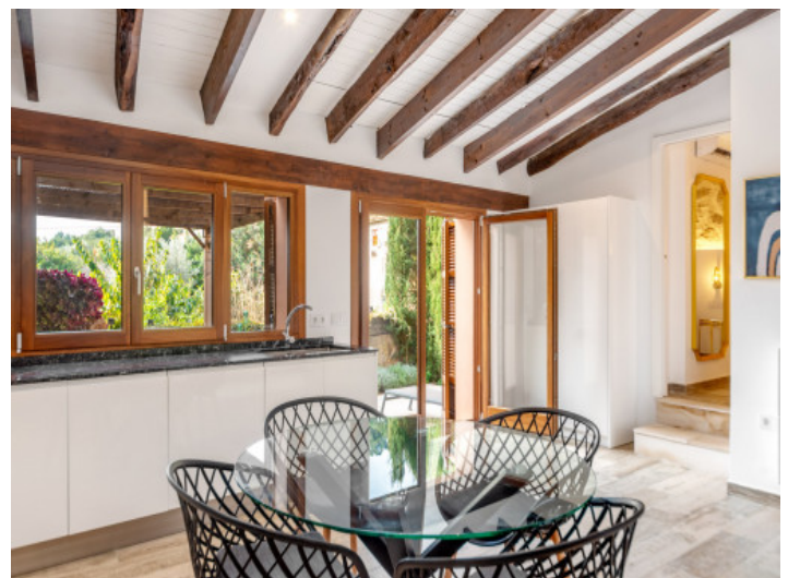
Dining area with direct access to the terrace

All information is correct to the best of our knowledge. Errors and prior sale excepted. This prospectus is purely for information purposes. Only the notarized deed of sale is legally binding.