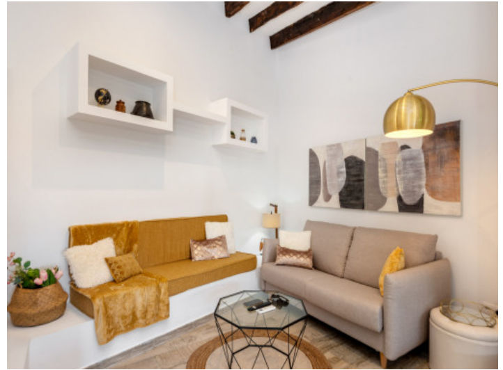
Elegant living area