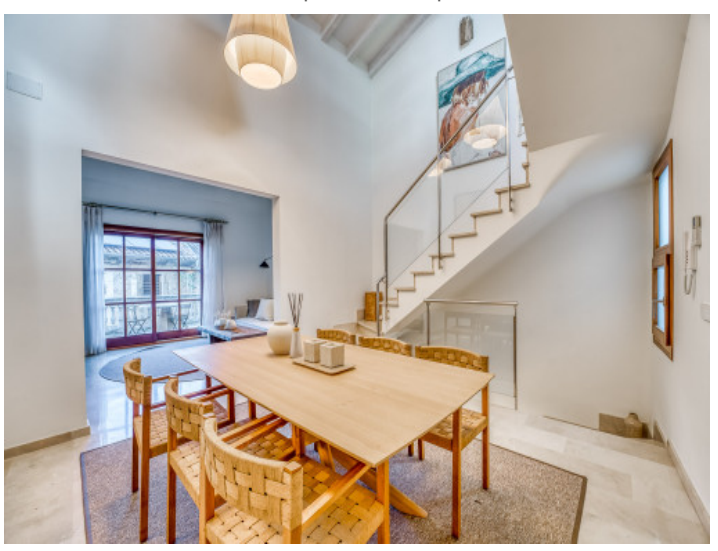
Gallery and dining area