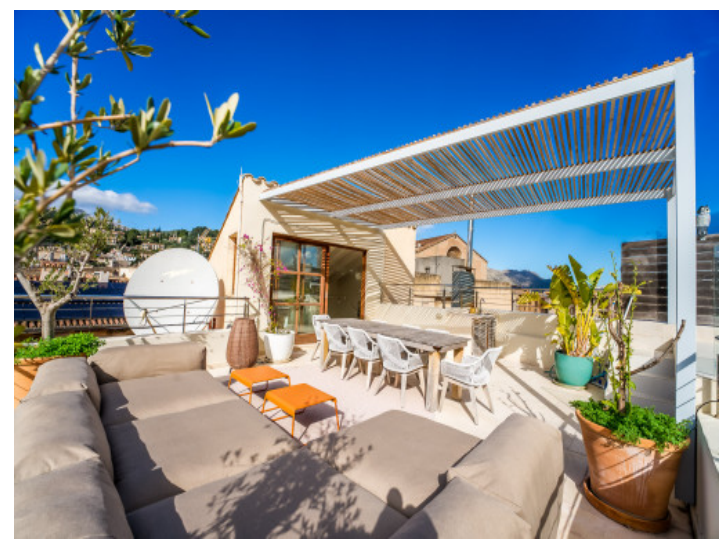
Roof top terrace with a view