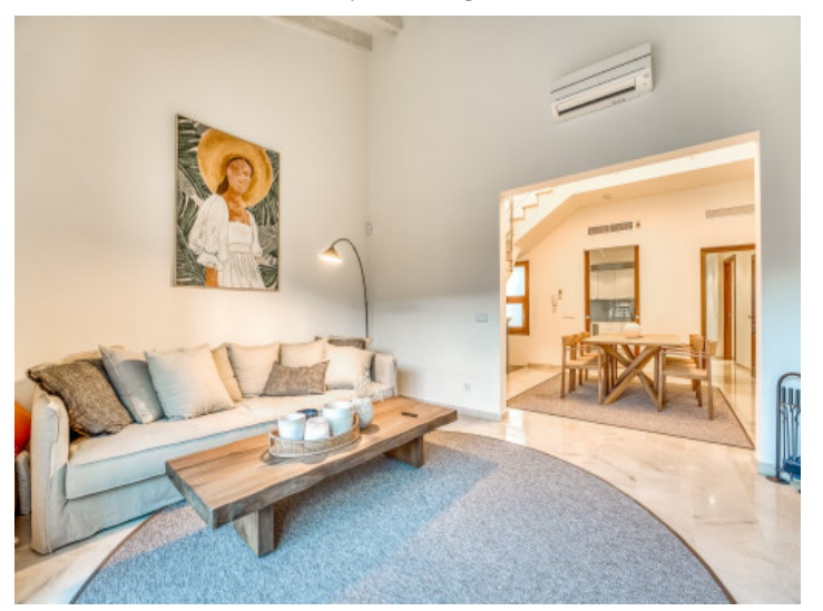
Living area Dining area All information is correct to the best of our knowledge. Errors and prior sale excepted. This prospectus is purely for information purposes. Only the notarized deed of sale is legally binding.

PORTA MALLORQUINA • C./ CONQUISTADOR 8, 07001 PALMA TEL. +34 971 698 242 • INFO@PORTAMALLORQUINA.COM