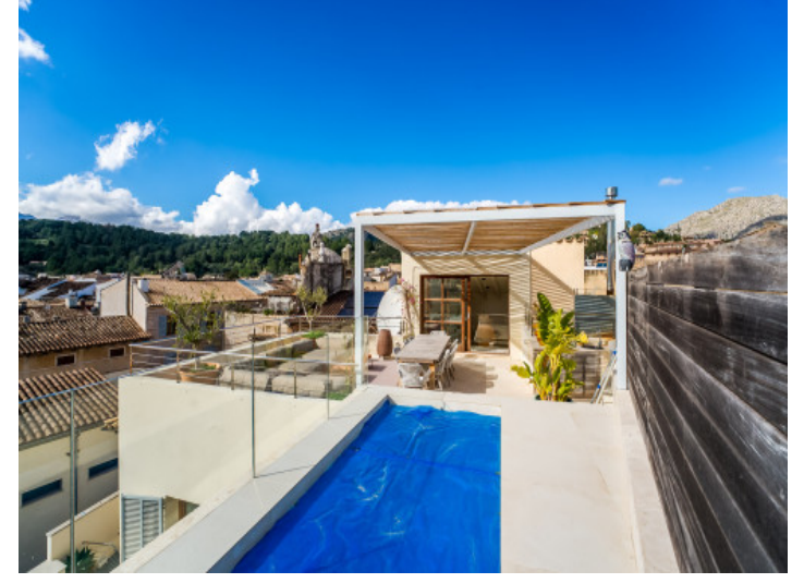
Roof top terrace with pool