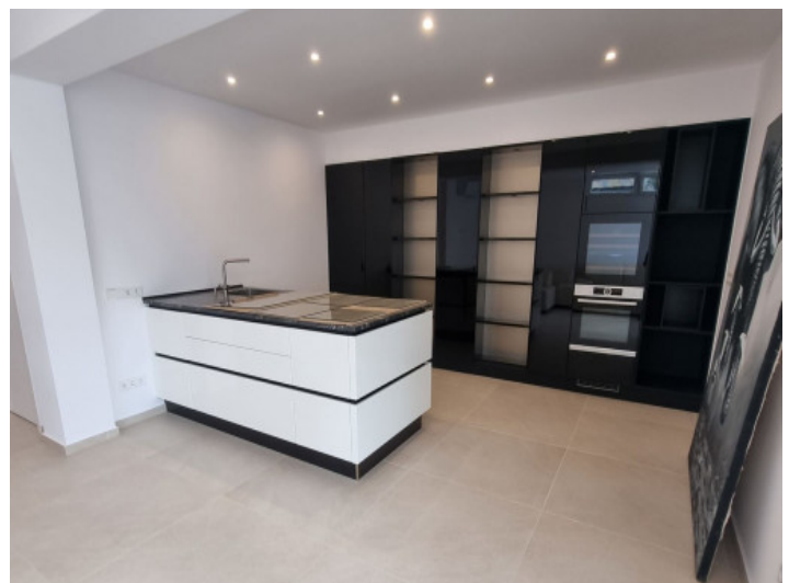
Kitchen guest area