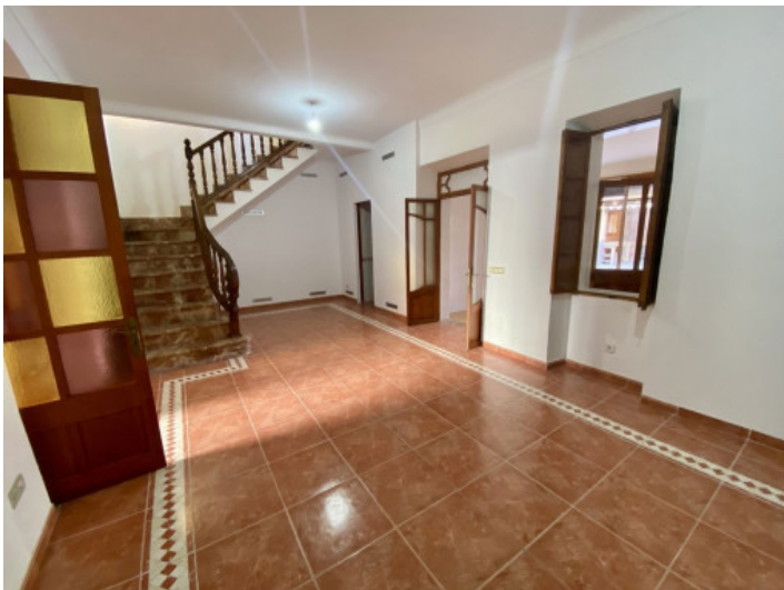
Entrance and living area