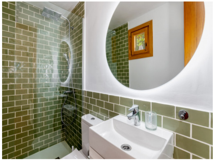
Bathroom with walk-in shower groundfloor