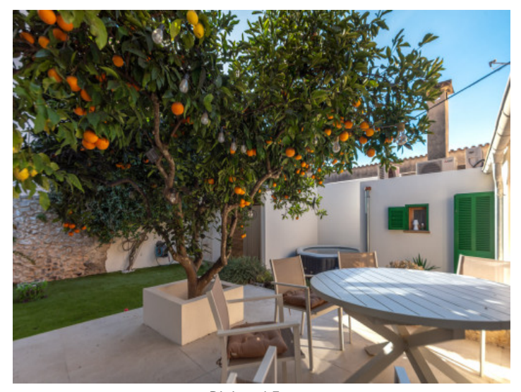
Dining al Fresco