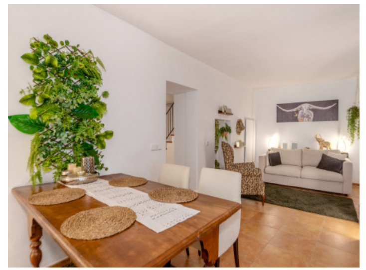
Dining and sitting area