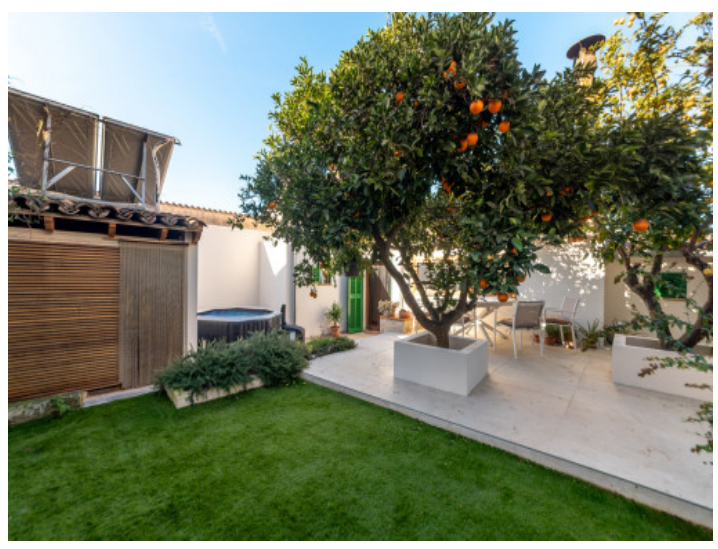
Façade Solar energy