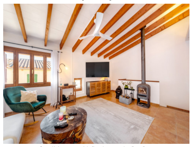
Cozy living area with fireplace on the first floor