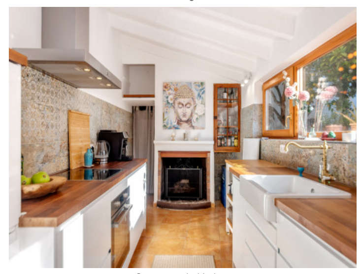
Country style kitchen