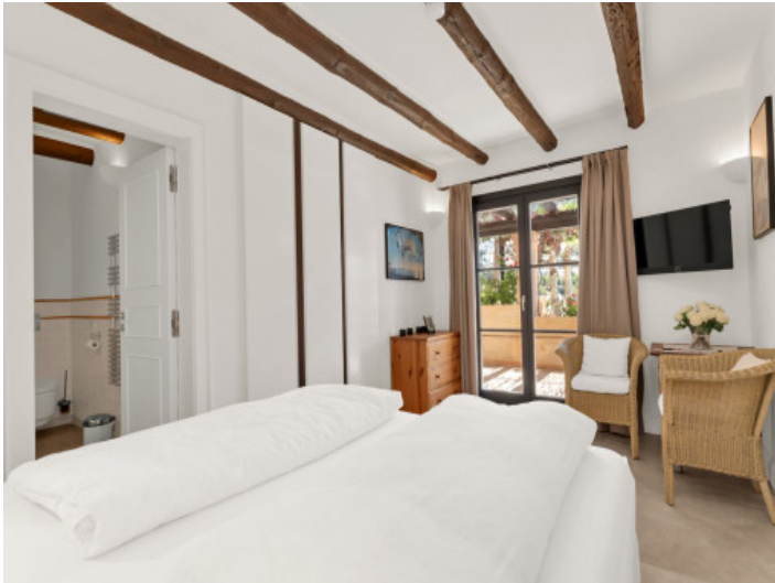
Bedroom with bathroom en suite