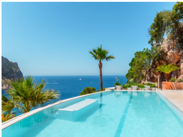
Fantastic pool area