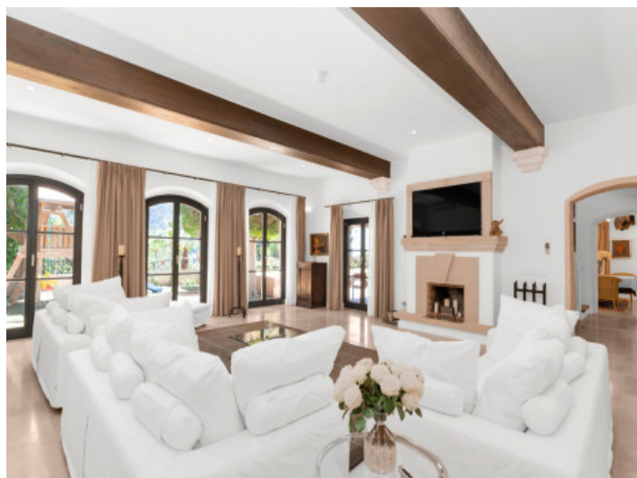
Large living area with fireplace

All information is correct to the best of our knowledge. Errors and prior sale excepted. This prospectus is purely for information purposes. Only the notarized deed of sale is legally binding.