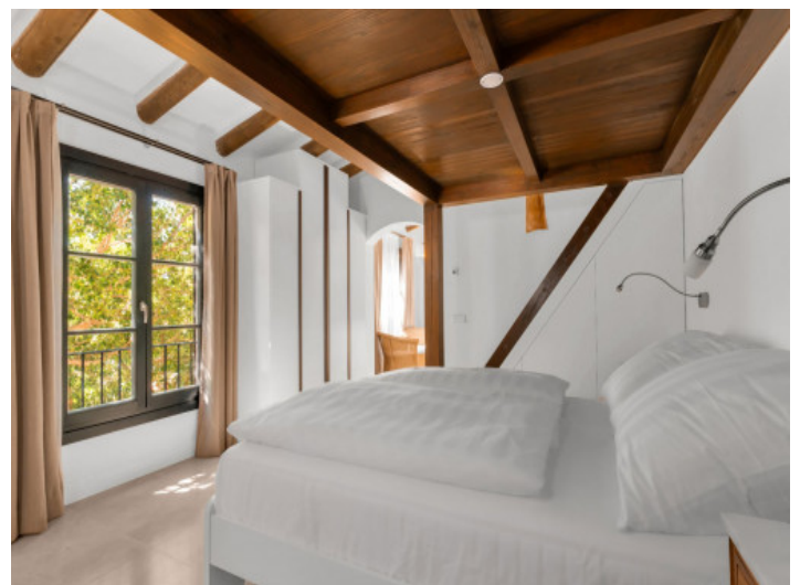
Bedroom guest area

All information is correct to the best of our knowledge. Errors and prior sale excepted. This prospectus is purely for information purposes. Only the notarized deed of sale is legally binding.