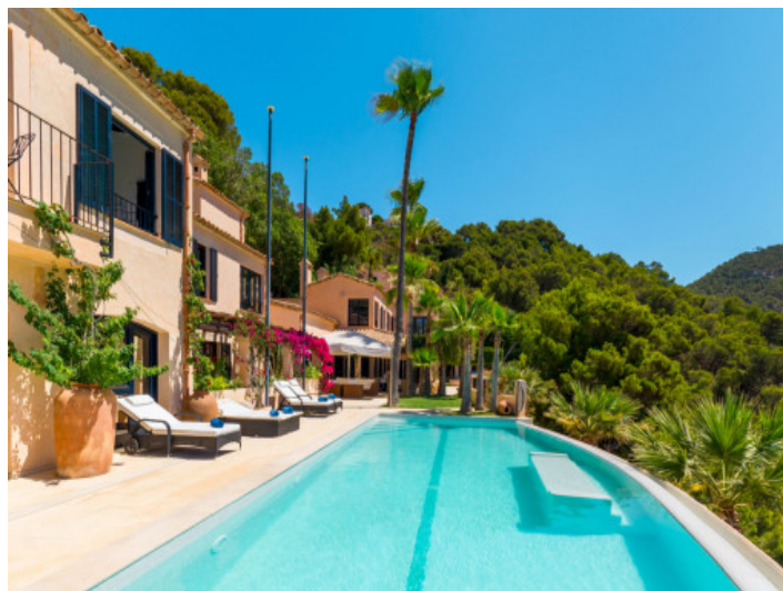
Beautiful pool area