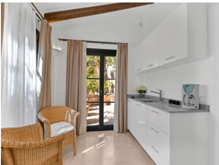
Kitchen guest area