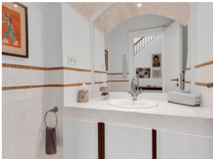
Bathroom guest area