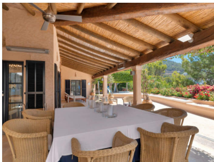
Dining al fresco