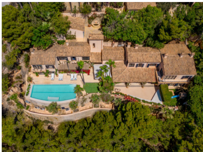
View to this amazing property