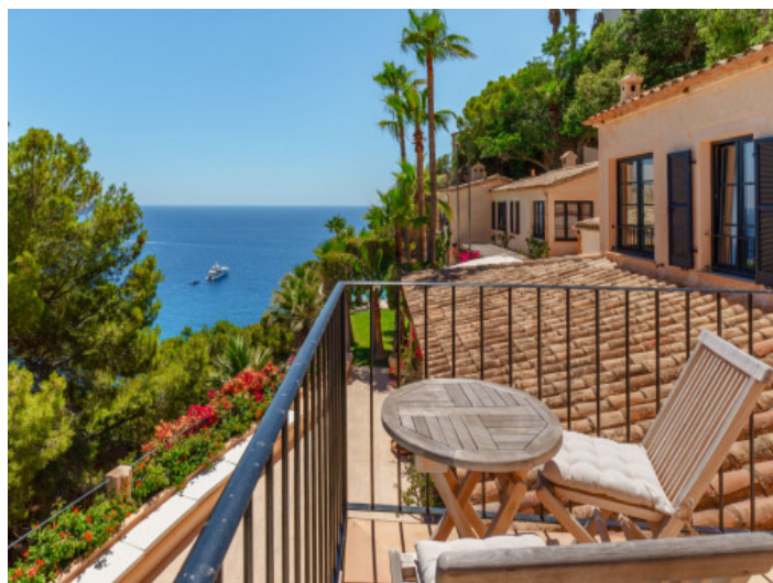
Amazing sea views

All information is correct to the best of our knowledge. Errors and prior sale excepted. This prospectus is purely for information purposes. Only the notarized deed of sale is legally binding.