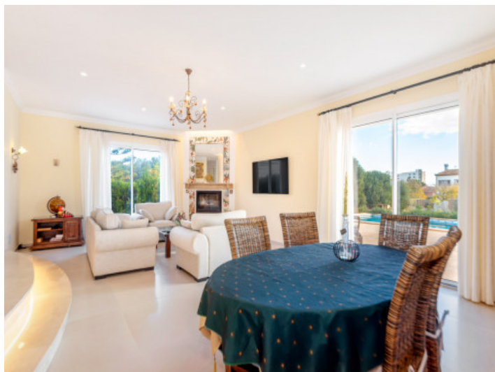
Dining and living area