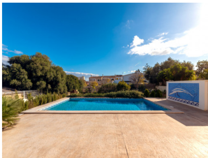
Pool and terrace