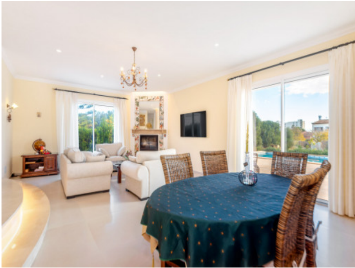
Dining and living area