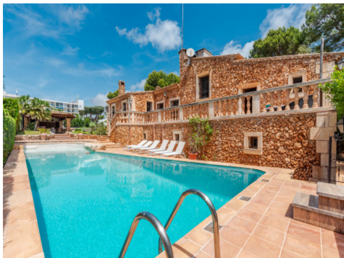
Majorcan villa with pool, garden and holiday rental licence in Costa de los Pinos