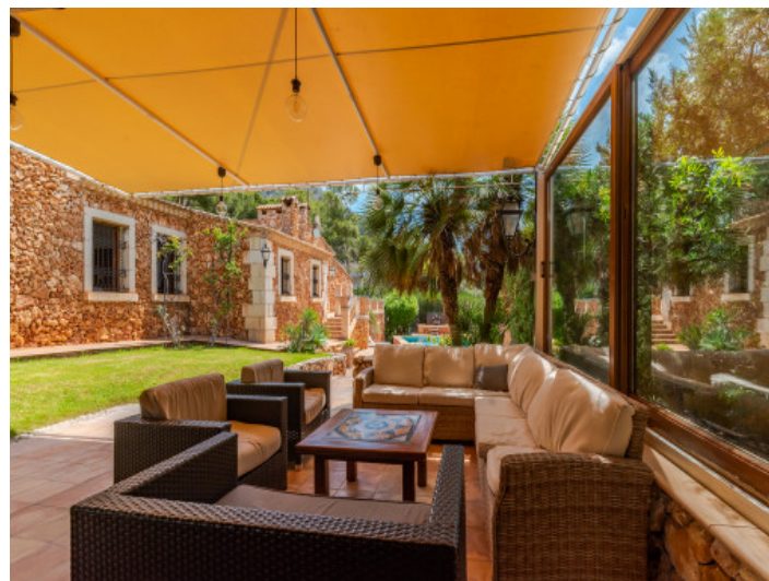
Covered terrace with comfortable seating