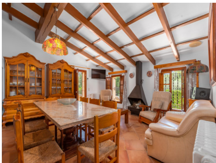
Living and dining area with fireplace